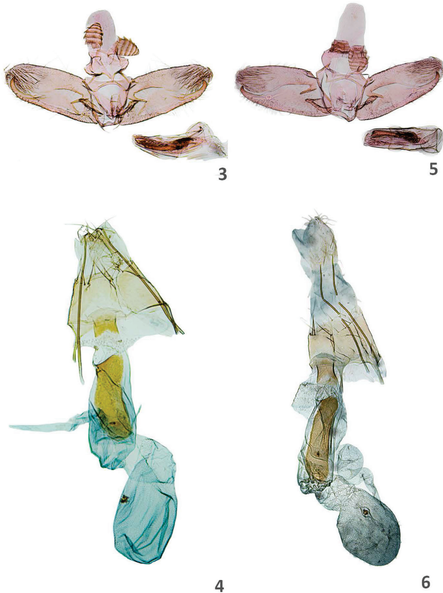
Figures 3–6. Zizyphia genitalia. 3. Z. cleodorella Chrétien, ♂; 4. Z. cleodorella Chrétien, ♀; 5. Z. zizyphella Amsel ♂; 6. ♀. In the male genitalia images the anellus has been severed from the rest of the genitalia and is surrounding the phallus.

extensive formations of Ziziphus lotus (“azufaifo” in Spanish) occur, together with patches of annual grassland. Tamarix sp., Ephedra sp., Ononis sp., Thymelaea sp. etc. complete the markedly African botanical character of this landscape, distinctive of the Retamar area where Z. cleodorella occurs.