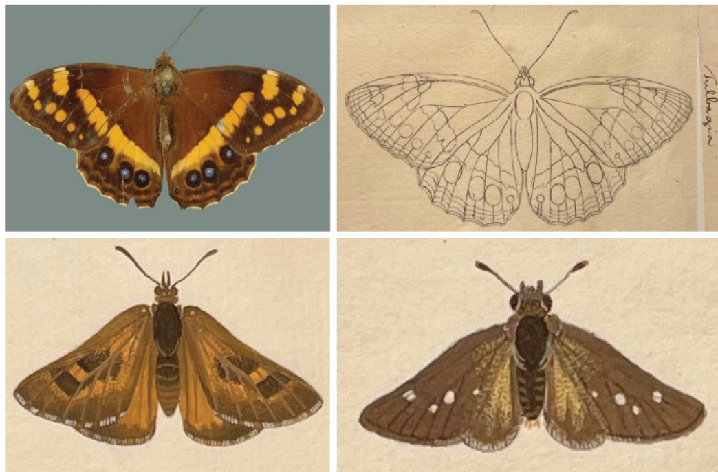
Figure 2. Above the lectotype (left) and Clerck's illustration of P. tulbaghia (right). Below: Clerck's coloured 'Icones' of P. protumnus (left) and P. niso (right). The latter was reproduced also by Aurivillius (1882, pl. 1) and Honey and Scoble (2001). Comparing these with the line drawings on Fig. 1 shows that Clerck used to add some details only during colouring.

in the absence of any direct evidence, it may be possible that some of the syntypes were either i) already present in Linnaeus' collection (p. 285), or ii) inadvertently remained among the Linnean materials purchased by J. E. Smith (the lectotypes of all the LSL specimens carry both Linnaeus' and Smith's labels) (see above and Figs 1, 2).