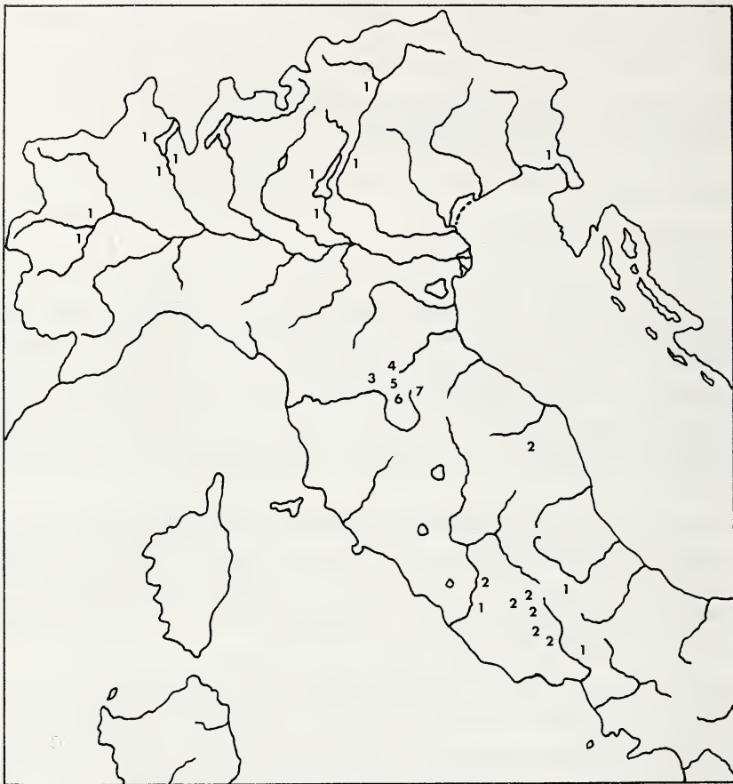
Fig. 1. Northern Italy. Scale 1 : 6.500.000.