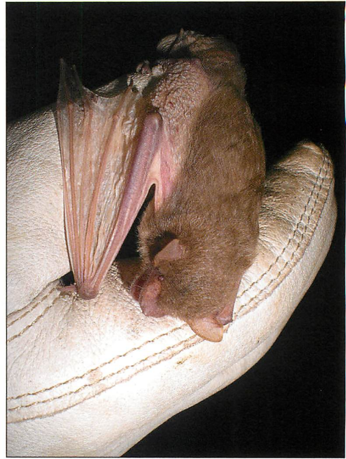
Figure 4. Rüppell's Pipistrelle ( Pipistrellus rueppelli ).

Since the boxes are installed permanently on the fields it is advisable to conduct a follow-up research in March and April within the following years to assess the effect of these bat boxes.