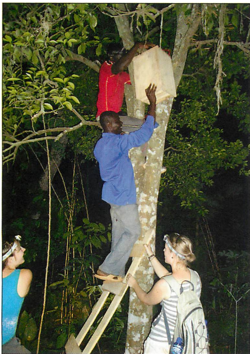
Figure 2. Bat box in cocoa plantation.

Bat boxes were hung up at four corners of the field (see fig. 1 and fig. 2). One was outfitted with chambers whereas the other was not, allowing the bats to hang free. Bat boxes were self-built from 20-25 mm thick using rough wood (i. e. Monopetalanthus spp.) and are of the size 400 x 250 x 300 mm (pers. comment GLOZA-RAUSCH 2010).