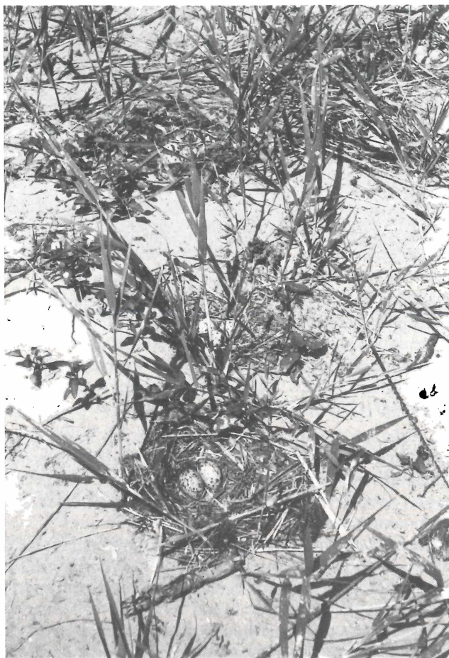
Photo 1. Nests of Mediterranean gulls among Phragmites communis vegetation. Foto 1. Nester der Schwarzkopfmöwen in Phragmites communis -Vegetation.

The first eggs were laid in the first week of May and the breeding peak was between the 15 th and 20 th of May. Isolated laying happened in June but we were not able to observe its course. The results of the egg laying (Tab. 1) include neither the laying in June nor the repeated clutches. (Table 1).