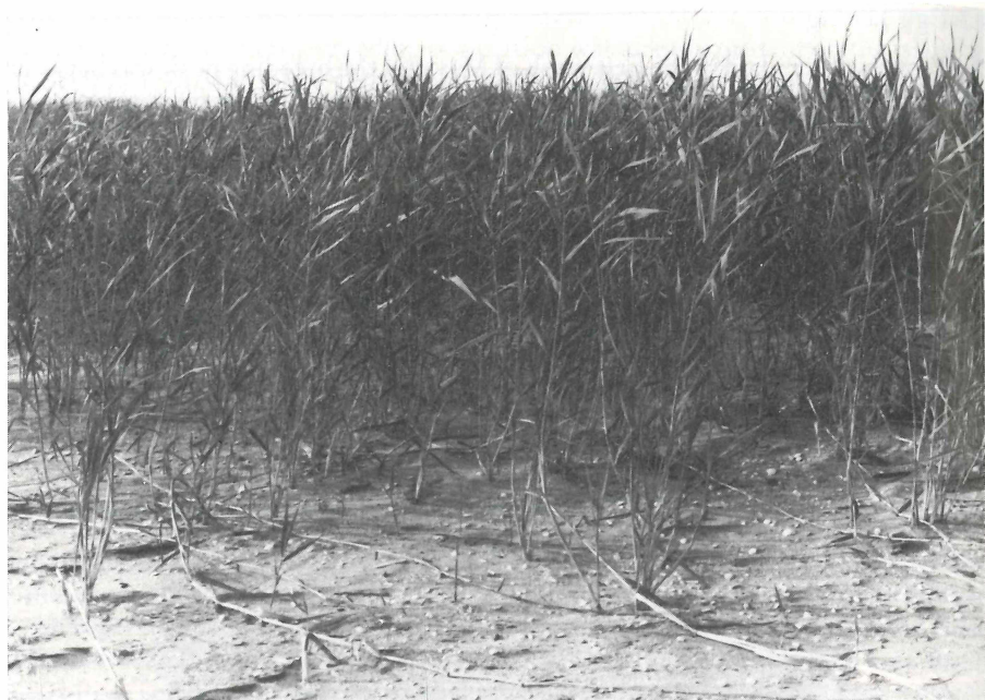
Photo 2. Part of the 1981's breeding site of the Mediterranean gulls, as appeared in early June of 1982. The vegetation of Phragmites communis is high and dense.

Foto 2. Teilansicht des 1981er Brutplatzes (Anfang Juni 1982 fotografiert). Die Vegetation von Phragmites communis ist hoch und dicht.