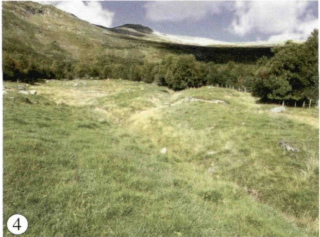
Fig. 2. Entoloma cremeoalbum, a part of the type material in situ. – Fig. 3. Map of southern Norway showing the known distribution of E. cremeoalbum. – Fig. 4. The type locality of E. cremeoalbum, an old pasture which is still grazed by sheep. Norway, Oppdal, Aunsætra, 30. 8. 2010.