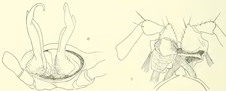
Fig. 6: Ochridaphe albanica (Verh.), male gonopods of paratype, ventral aspect (in situ), showing tibial remnant. Fig. 7: O. albanica , base of 2nd legs and genitalia of female paratype, caudal aspect, the left cyphopod removed to show coxosternal details.