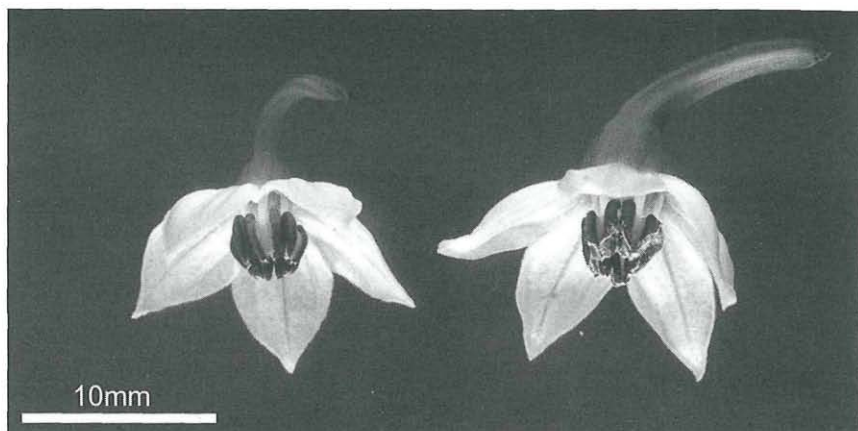
Fig. 1. Appearance of in vitro (on the left) and in vivo (on the right) flowers of Capsicum annuum L. cv. Sweet Banana. – Scale bar = 10 mm.