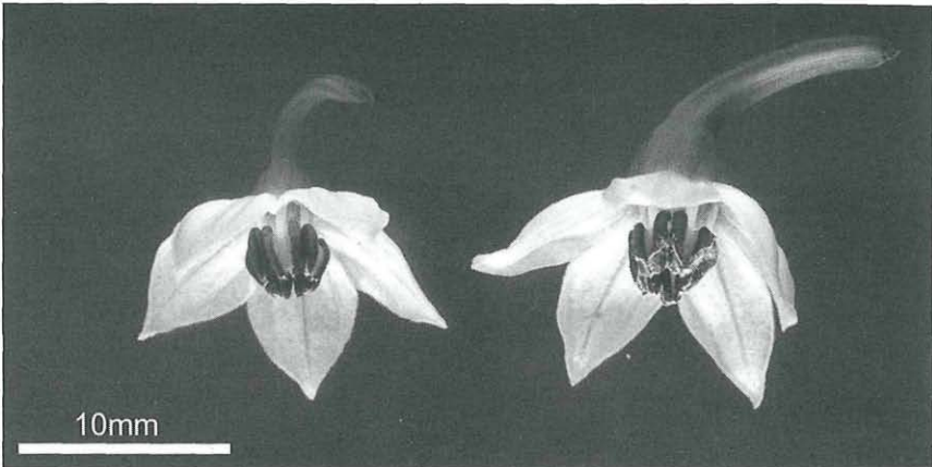
Fig. 1. Appearance of in vitro (on the left) and in vivo (on the right) flowers of Capsicum annuum L. cv. Sweet Banana. – Scale bar = 10 mm.