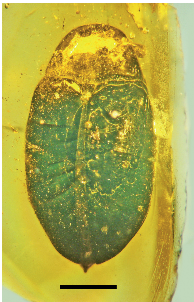
Fig. 1. Dorsum of Chelonarium dominicanum sp. nov. in Dominican amber. Scale bar = 1.3 mm.

Type: Holotype (unknown sex). Accession # C-7-403 deposited in the POINAR amber collection maintained at Oregon State University. Syninclusions include minute organic particles and a phoretic mite attached to the specimen.