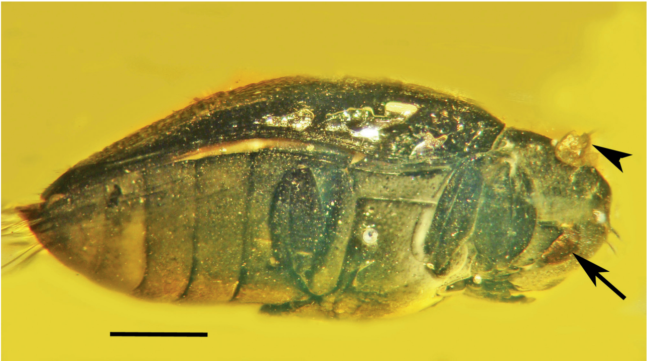
Fig. 3. Lateral view of Chelonarium dominicanum sp. nov. in Dominican amber. Arrow shows eye. Arrowhead shows phoretic mite on pronotum. Scale bar = 0.9 mm.