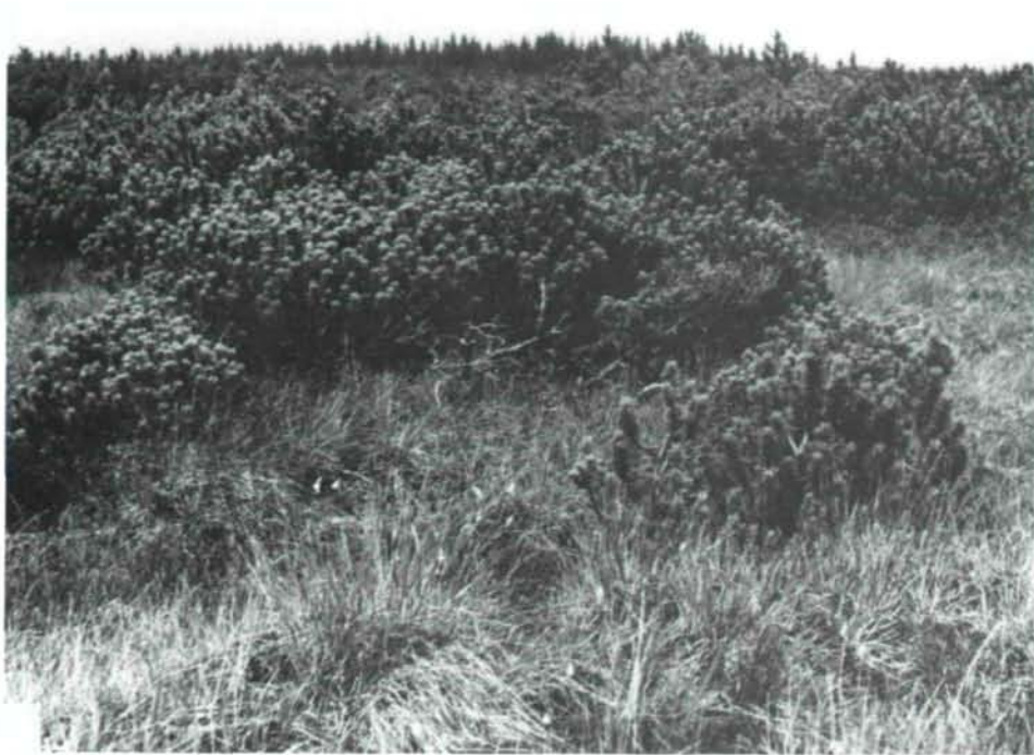
Fig. 1: Characteristic habitat of Pediasia truncatella (ZETT.) in the Bohemian Forest Mountains. - The Jezerní slat peat bog near Kvilda.