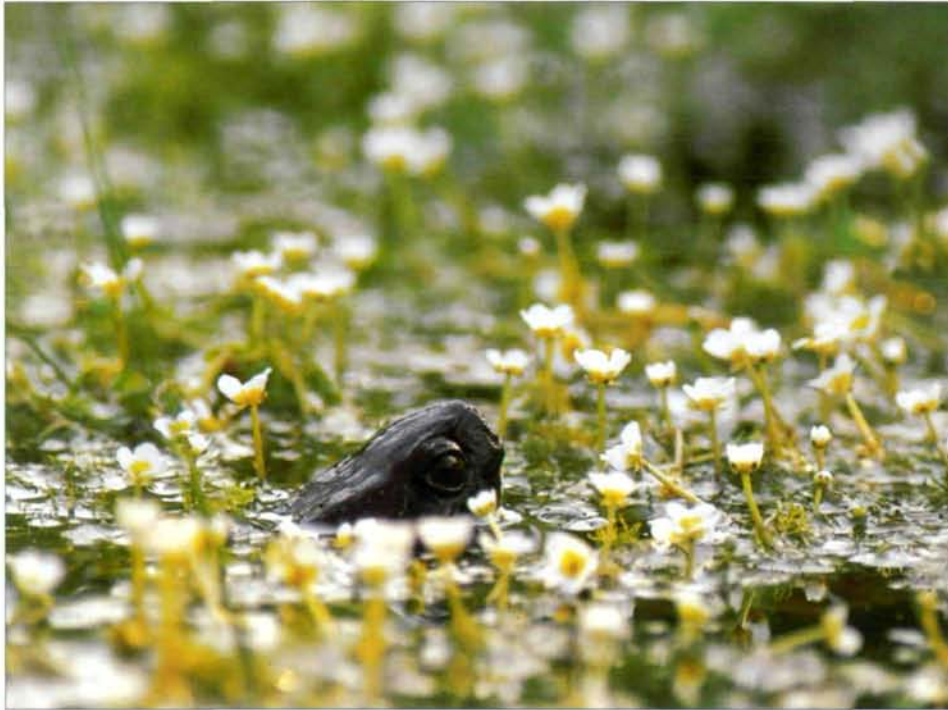
Fig. 6: Adult males usually have reddish iris. Although this feature alone cannot be used for sex identification, it may be useful for nature observations when only the turtles' heads reach above the water surface.

JABLONSKI (1998) and JABLONSKI & JABLONSKA (1998) report on 120 years old individuals, but their data is highly anecdotal. It is obvious that the European pond turtle is a long lived animal, but more information is needed on the subject.