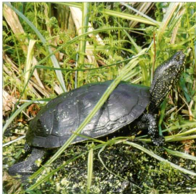
Fig. 7: A basking European pond turtle. The easiest way for observation is to watch them basking on banks. In spring, when the water is cold, they spend a lot of time basking.

ZEMANEK & MITRUS 1997) (Fig. 7). Very small individuals were noted basking on leaves of water plants as well. Places used for basking are often easily identified by trampled plants and soil. As water and air temperature is lower during earlier parts of the year, individuals spend more time on basking in spring than in summer. Spring is the best time for observation as the animals are generally less alert during this period.