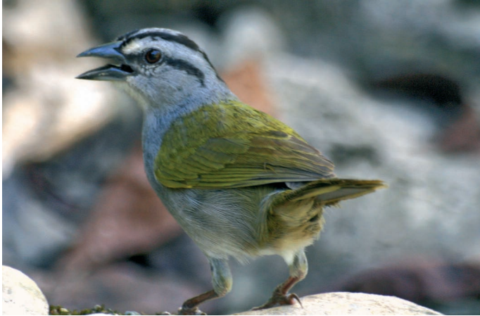
Fig. 23: Arremonops conirostris (Black-striped Sparrow).