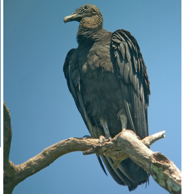
Fig. 5: Sarcoramphus papa (King Vulture).