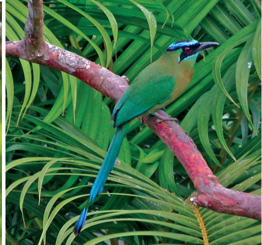
Fig. 11: Momotus momota (Blue-crowned Motmot).