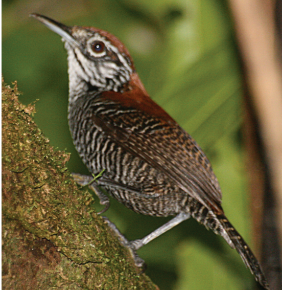
Fig. 18: Thryothorus semibadius (Riverside Wren).