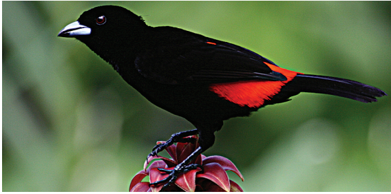
Fig. 21: Ramphocelus costaricensis (Cherrie's Tanager).