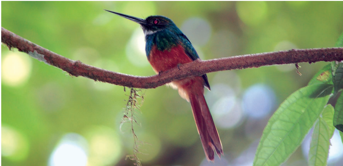
Fig. 12: Galbula ruficauda (Rufous-tailed Jacamar).