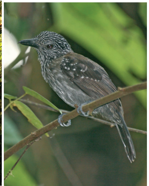
Fig. 15: Thamnophilus bridgesi (Black-Hooded Antshrike).