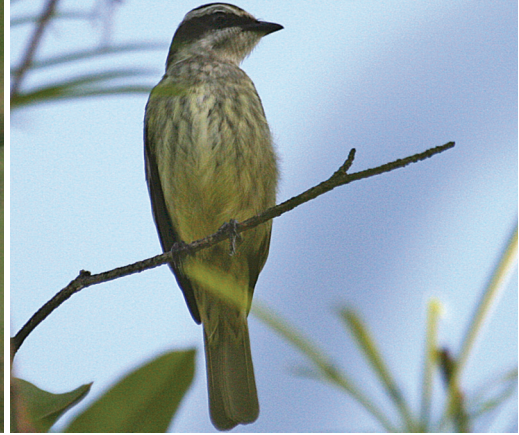
Fig. 17: Legatus leucophaeus (Piratic Flycatcher).