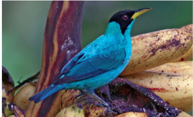
Fig. 22: Chlorophanes spiza (Green Honeycreeper).