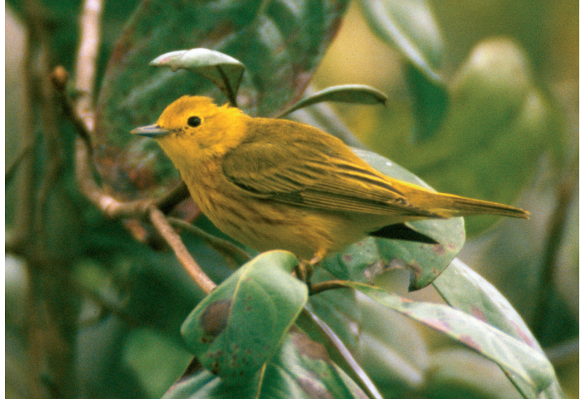
Fig. 19: Dendroica petechia (Yellow Warbler).