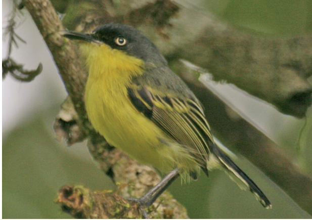
Fig. 16: Todiostrom cinereum (Common Tody-Flycatcher).