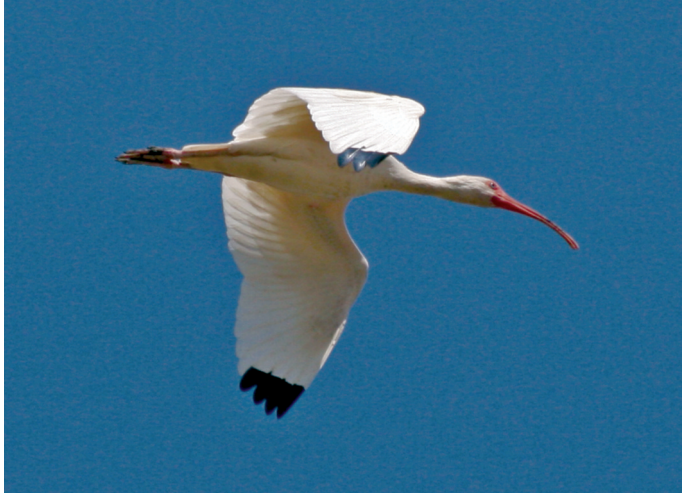
Fig. 4: Eudocimus albus (White Ibis).