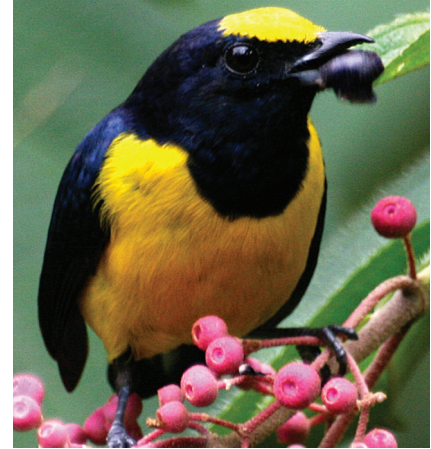
Fig. 24: Euphonia imitans (Spot-crowned Euphonia).