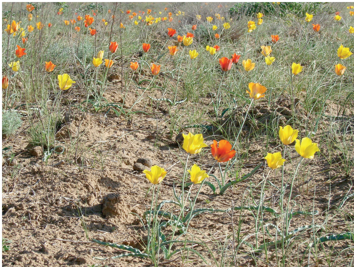
Fig. 1: Large population of Tulipa lehmanniana in South-Eastern Kyzylkum.

This species is widespread on all ridges of the Nuratau mountains, from eastern to western extreme end. It grows as solitary specimens, small groups or large populations (up to several hundred plants), at 800-900 m a.s.l. to 1800-2000 m a.s.l., among forb-tall grass, sagebrush-herbaceous communities, semishrubs and shrubs, particularly on relatively humid northern and western slopes. The largest populations registered on the Nuratau ridge, where Tulipa affinis occurs quite often (Fig. 4). The number of generative specimens in local populations vary from 4-5 to 70-80, 100 or more per 100 m 2 . In some areas on the watershed of Nuratau, blooming tulips makes the landscape bright red, there are up to 4-5 generative specimens per 1 m 2 .