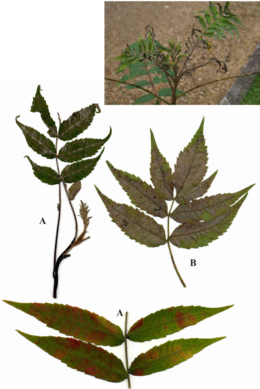
Plate 1: Symptoms of the powdery mildew Podosphaera cf. pruinosa on Rhus hirta . A – epiphyllous symptoms, B – hypophyllous symptoms.