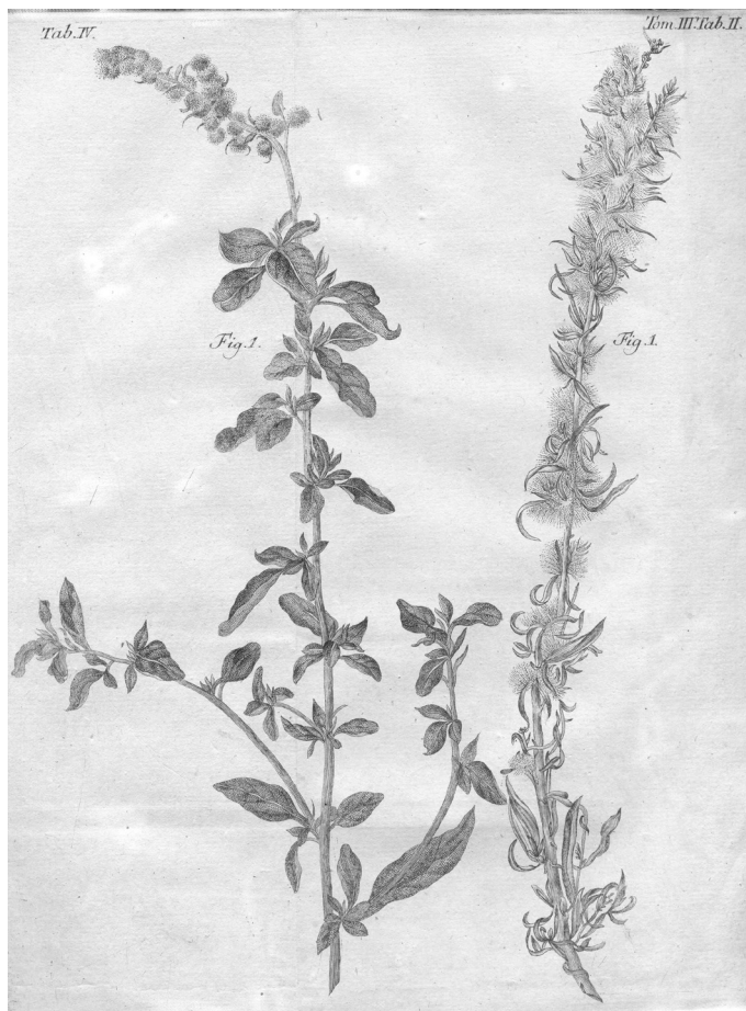
Fig. 1: The first drawing of Krascheninnikovia ceratoides in the Flora Sibirica , Tomus III. 1768, Tabula II, Figura I (plant right). The plant left: Axyris hybrida , Tabula IV, Figura 1.

The monotypic genus Ceratospermum of PERSOON (1807) is valued as just the same. Persoon arranged Axyris ceratoides and Diotis [without epithet] in the synonymy of Ceratospermum papposum Pers. He took over unchanged the three annual species of Axyris from Linné. Persoon left this Axyris ssp. among the “Monoecia Triandria,” but he arranged Ceratospermum papposum to the “Monoecia Tetrandria.”