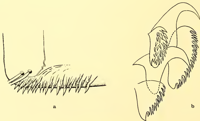
Fig. 2: Diagnostic features of immature Virgatanytarsus spp. (a) Anal comb of segment VIII of V. triangularis pupa, (b) Claws of posterior parapod of V. arduennensis larva.