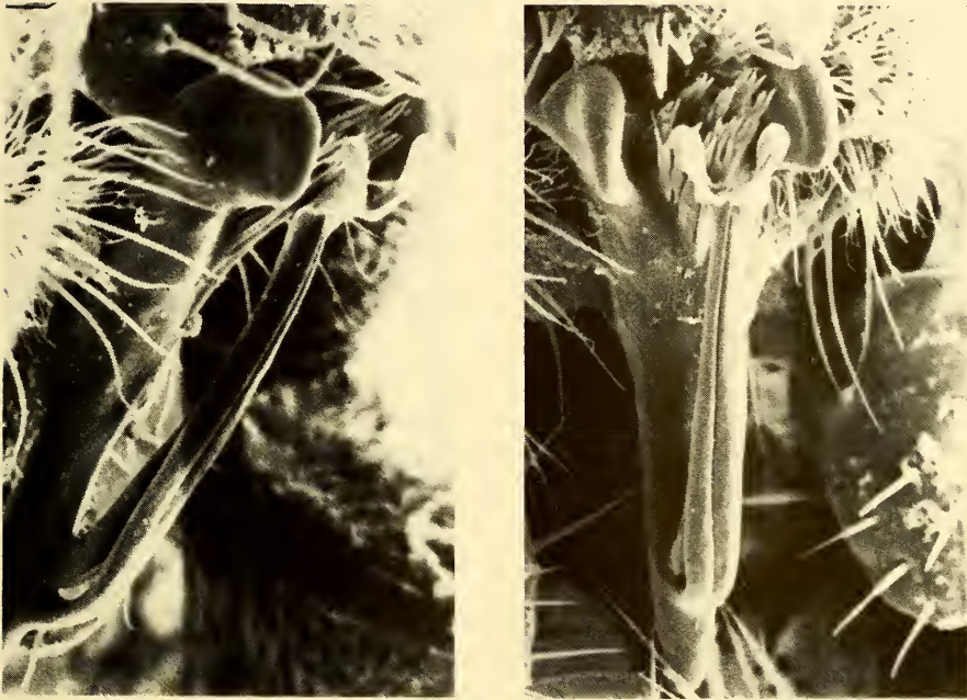
Fig. 3: Scanning electron micrographs of anal point of V. maroccanus ; lateral, dorsal.

Larva: some claws of posterior parapod in form of more or less triangular plates, with 1 or more rows of hooklets along 1 side (Fig. 2b).