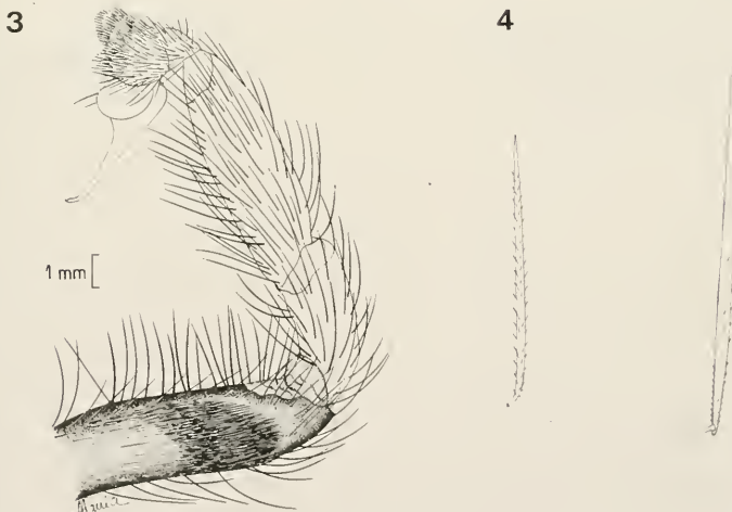
Fig. 3. Area of urticant hairs on the prolateral surface of the pedipalp femur of Ephebopus murinus .