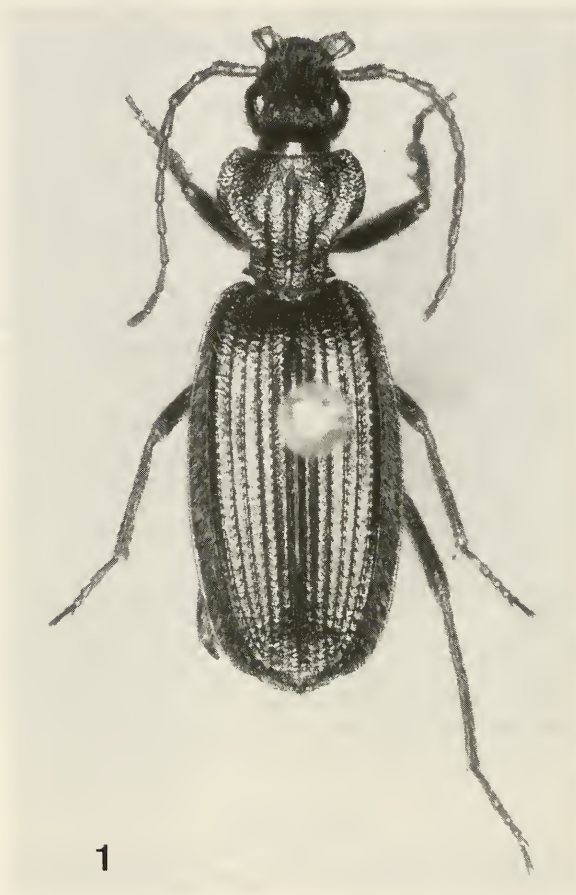
Fig. 1. Acrogenys centralis , spec. nov. ♀ paratype. Length: 12.7 mm.