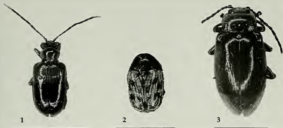
Figs 1-3. 1. Lema sp. near L. connectens Baly, Passam, 25.III.1989, TJH, on Alpinia sp. (Zingiberaceae) (Scale: 6 mm). 2. Cadmus sp. near C. latus Gressitt, Passam, 7.VI.1989, TJH, on Macaranga quadriglandulosa Warb. (Euphorbiaceae) (Scale: 4 mm). 3. Phyllocharis apicalis Baly, Passam, 10.III.1989, TJH, on Clerodendrum sp. (Verbenaceae) (Scale: 3.5 mm).