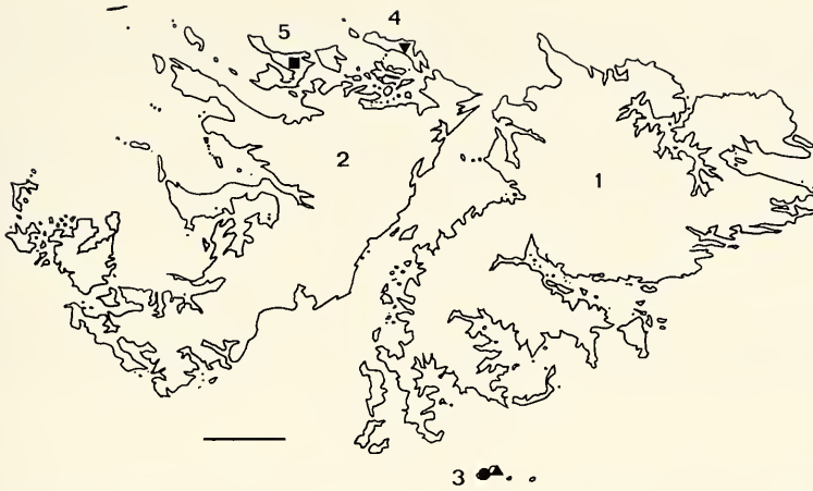
Fig. 4. Map of Falkland Islands with distribution of the Pseudomigadops -complex. 1. East Falkland Island. 2. West Falkland Island. 3. Sea Lion Island. 4. Pebble Island. 5. Saunders Island. Pseudomigadops handkei handkei : ●; P. handkei punctatus : ■; P. fuscus fuscus : ▼; P. fuscus sericeus : ▲. Scale: 25 km.