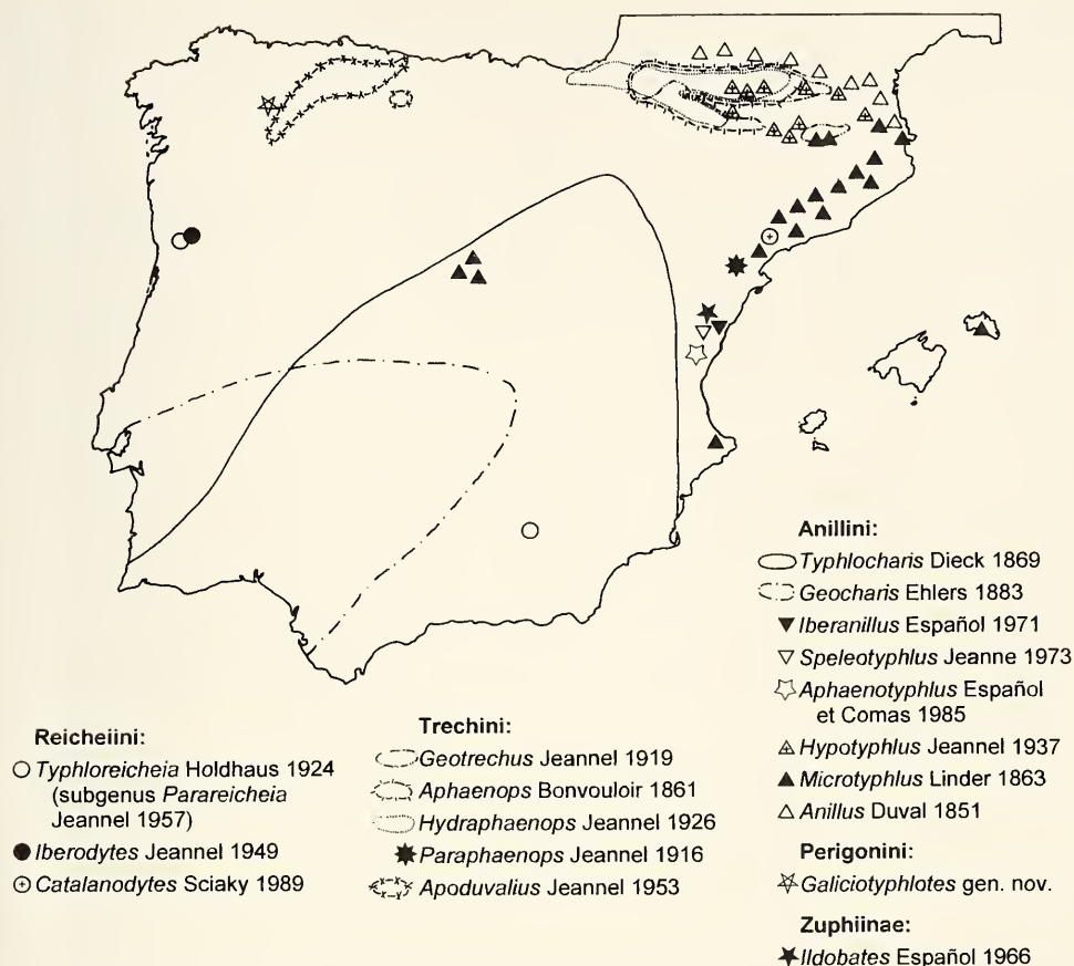
Fig. 6. Distribution of anophthalmic carabid genera on the Iberian Peninsula (incl. French parts of the Pyrenees) (modified after the data of Bonadona 1971, Sciaky 1989, Saldago-Costas 1993, Zaballos & Jeanne 1994). The genus Parareicheia is incorporated and the genus Reicheia Saulcy 1863 is excluded due to the characterisation of Jeannel (1957) as anophthalmic or microphthalmic, respectively (but see also Sciaky 1989). Apoduvalius is taken into account because the physiological function of the strongly reduced 'eye region' as a photoreceptor has not been proven. The taxonomy and the ranges of some genera are still subject to intensive research (e.g. Zaballos & Ruiz-Tapiador 1998), therefore the marked limits seem to be preliminary.

vegetation of nearly any kind (Jeannel 1942, Lindroth 1972, 1985, 1986). Erwin (1979: 591) characterises the members of this tribe as "tropically and warm-temperate adapted in all regions". If the ancestor of Galictiophlotes had a comparable temperature requirement, it may have arrived in Spain during a warmer climatic period (e.g. Pliocene or earlier). An adaptation to the changing climatic conditions (e.g. in the glacial period) has to be postulated (like for the Central African species Typhlonestra elgonensis , which lives in the alpine zone with Senecio -woodlands at about 3500 m at the Mount Elgon, and for the Perigonillus species exclusively found in higher altitudes of east African mountains). Therefore it may be supposed that the new genus is an ancient relict of a much wider distribution of the Perigonini.