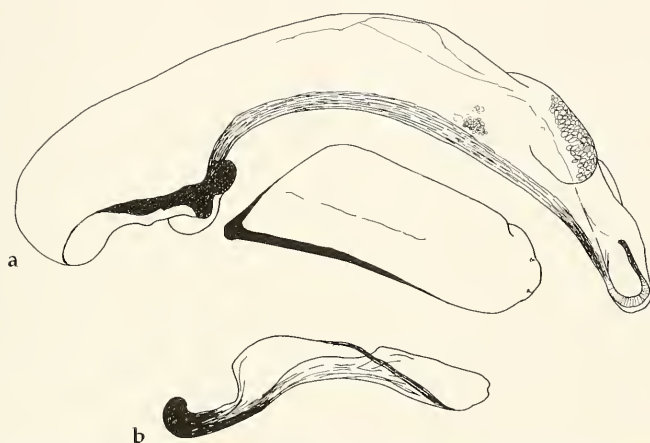
Fig. 4. Galiciotyphlotes weberi , gen. nov., spec. nov. ♂ genitalia. a. Aedeagus and left paramere. b. Right paramere.

developed, obsolete to the front and the base; 1 pair of pronotal foveae, without punctation and reduced to elongated impressions.