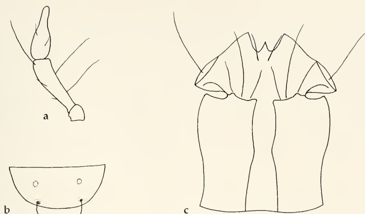
Fig. 3. Galiciotyphlotes weberi , gen. nov., spec. nov. Ventral surface. a. Labial palpus. b. Mentum, submentum, and glossa. c. Sternite VII.