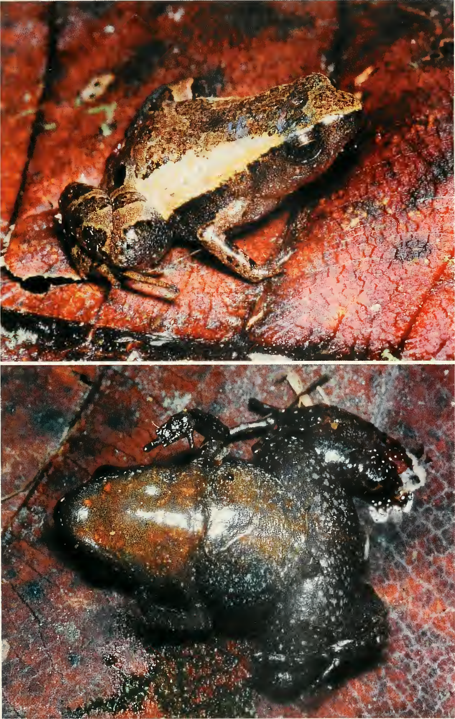
Fig. 1. Dorsolateral and ventral view of the holotype of Phyllonastes ritarasquinac , spec. nov. (CBF 3350) in life. SVL 14.1 mm.