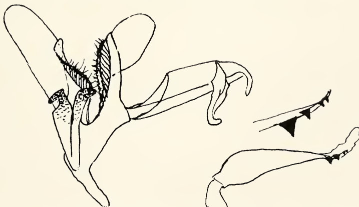
Fig. 1. Turatia argillacea , spec. nov., holotypus. Male genitalia ventrally; aedagal spines also magnified.

Types. Holotype: ♂ Tanganjika Songea, Peramiho 1.000 m, 24. VIII. 1952 leg. Lindemann und Pavlitzki Staatsslg. München "ZSM Genitalprp. No. 988" "Holotypus Turatia argillacea Gozm. gen. prep. No. 3772 det. L. Gozmány". – Paratype: First label as for holotype "Genitalia K. Sattler 507 b" "Paratypus Turatia argillacea Gozm. det. L. Gozmány". The slide of the paratype could not be found in the collection, and I have not seen it. Both type specimens are preserved in the Zoological State Collection, Munich (ZSM).