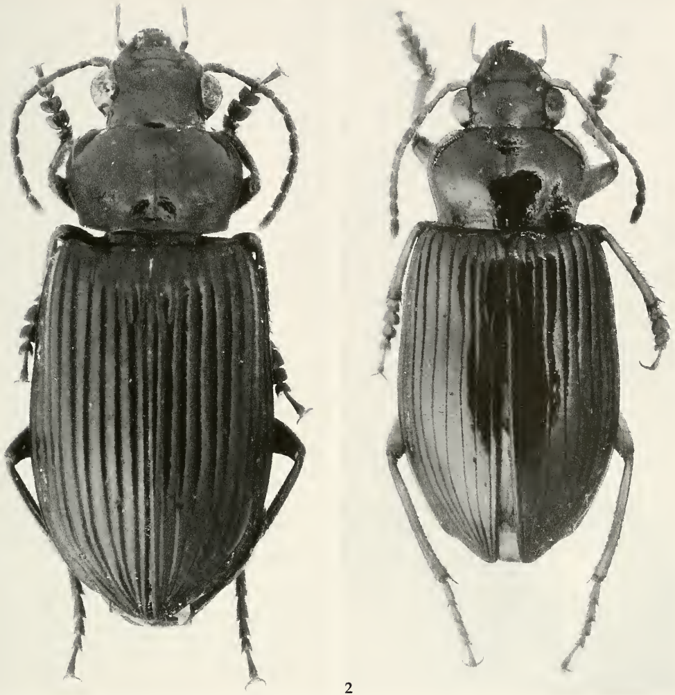
Fig. 1. Habitus of Notiobia variabilis , spec. nov. (paratype).