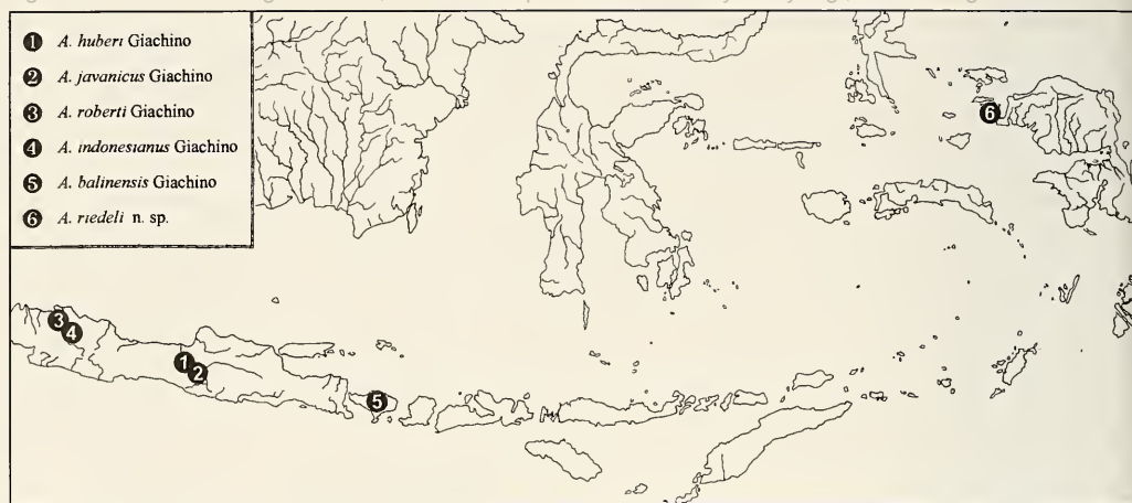
Fig. 3. Distribution map of the Argiloborus of the "huberi species group".