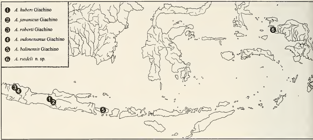
Fig. 3. Distribution map of the Argiloborus of the "huberi species group".