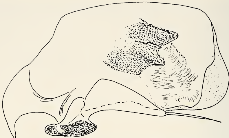
Fig. 1. Argiloborus burckhardtii Giachino, 2001. Aedeagus, lateral view. Scale: 0.1 mm.

The sizes of the male are as following: total length (from tip of mandibles to end of elytra) 1.15 mm. Pronotum slightly less transverse than in the female, with the ratio max. width/ max. length: 1.16; 1.27 in the female. Elytra a little narrower in the male (max. length/max. width ratio: 1.71; 1.57 in the female).