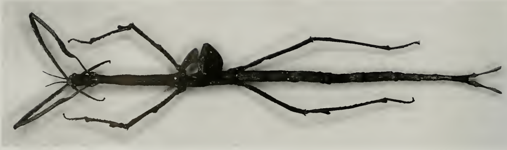
Fig. 1. Paractenomorpha baehri , gen. nov. & spec. nov. Holotype (♀).

slightly longer than wide). Pro- and mesothorax minutely but densely granulose. Granules of mesonotum partly enlarged and forming minute spines. Mesothorax at least 2.5× longer than head and pronotum combined. Tegmina slender, oval, slightly projecting over posterior margin of metanotum. Alae strongly reduced, ± equal in length to tegmina, at best reaching half way along tergite II. Anal region greyish black with irregular transparent markings towards base. Median segment slightly longer than metanotum. Abdominal segments II-VII at least 2× longer than wide, parallel-sided. Sternite VI with a pair of rounded, leaf-like lobes at posterior margin. Anal segment with a median carina and small triangular medial incision at posterior margin. Operculum short, not reaching posterior margin of anal segment. Cerci very elongate, at least as long as tergites VIII-X combined, laterally compressed and irregularly leaf-like. All carinae of the legs more or less prominently serrate and dentate, except the dorsal carinae of meso-, metafemora and tibiae. Posterodorsal carina of meso-, metafemora and tibiae with a more or less prominent lobe in basal half and slightly rounded apically. Probasitarsus as long as remaining segments combined. Meso- and metabasitarsus as long as combined length of remaining segments except claw.