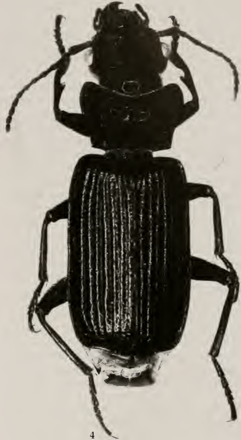
Figs 3, 4. Habitus. 3. Schuelea monstrosa , spec. nov. Length: 15.5 mm. 4. Schuelea drumonti , spec. nov. Length: 14.5 mm.

Colour. Glossy black, only the anterior margins of clypeus and labrum, and the tips of the palpi reddish.