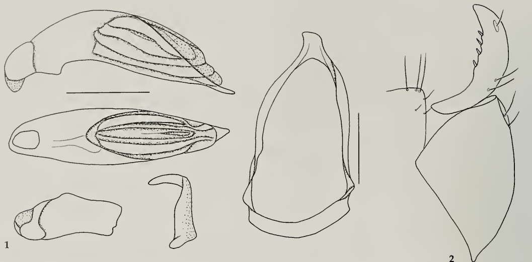
Fig. 1. Schuelea monstrosa , spec. nov. ♂ aedeagus, parameres, and genital ring. Scale: 1 mm.