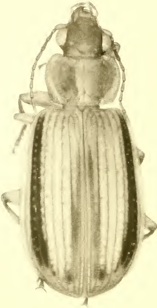
Fig. 1. Amblytelus fallax , spec. nov., holotype. Habitus and colour pattern. Length: 9.5 mm.