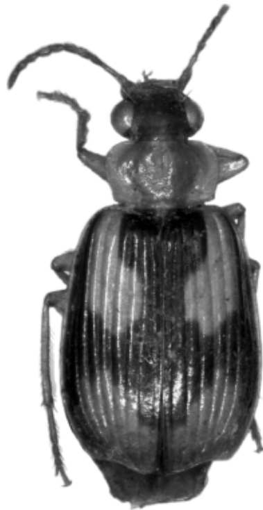
Fig. 2. Lebia edentata , spec. nov. Habitus. Body length: 6.3 mm.

Female genitalia. Stylomeres of typical Lebia -like shape: stylomere 2 short, apically rounded, both stylomeres devoid of any setae.