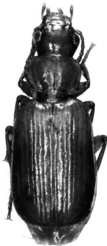
Fig. 1. Diabaticus rufescens , spec. nov. Habitus. Body length: 6.6 mm.