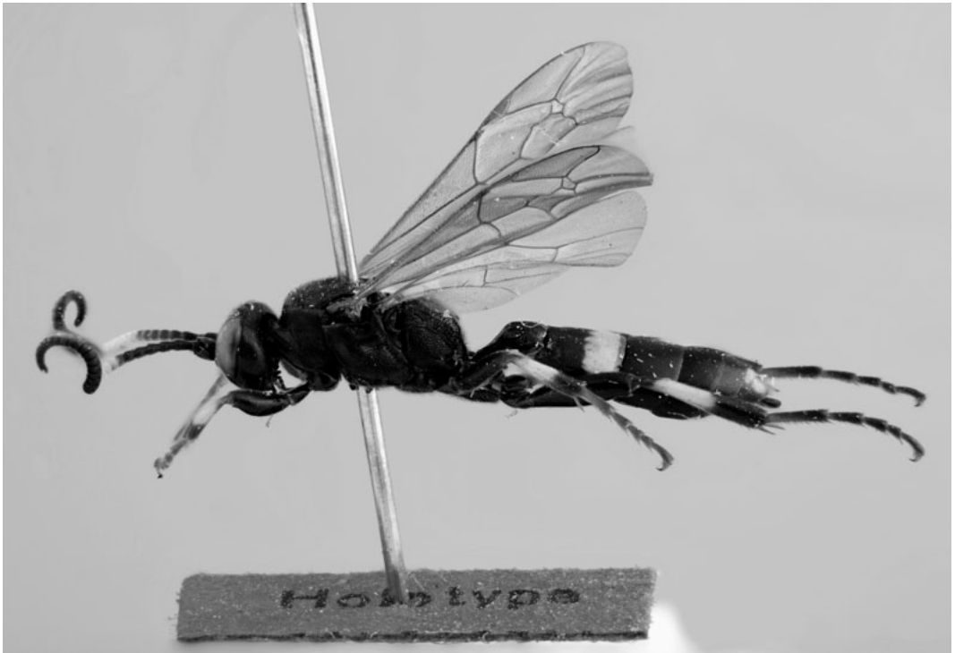
Fig. 1. Female holotype of Ichneumon feriens Heinrich. Typical preparation of an Ichneumon specimen by Gerd Heinrich.

the systematics of the birds of Angola (Weems 1977). The Heinrich collection of the ZSM is by far the most important collection of Ichneumoninae in the world, including numerous types and about 23,000 thoroughly mounted and accurately labelled specimens. All specimens are mounted on pins (Fig. 1) with wings usually directed upward and legs arranged more or less symmetrically.