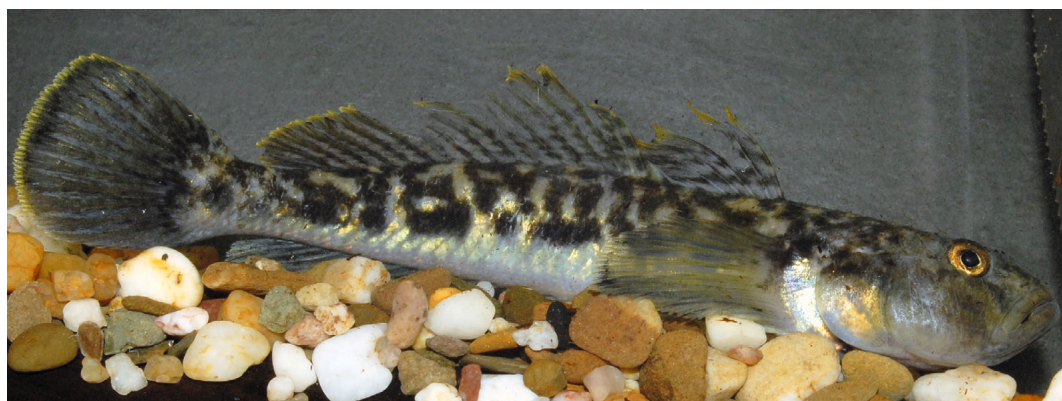
Fig. 3. Neogobius fluviatilis (ZSM 41740), photographed shortly after collection.