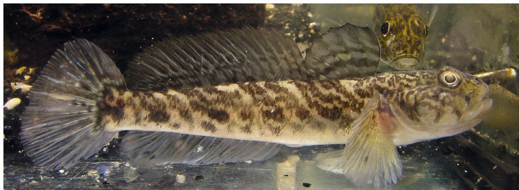
Fig. 2. Babka gymnotrachelus (ZSM 41739), photographed shortly after collection.