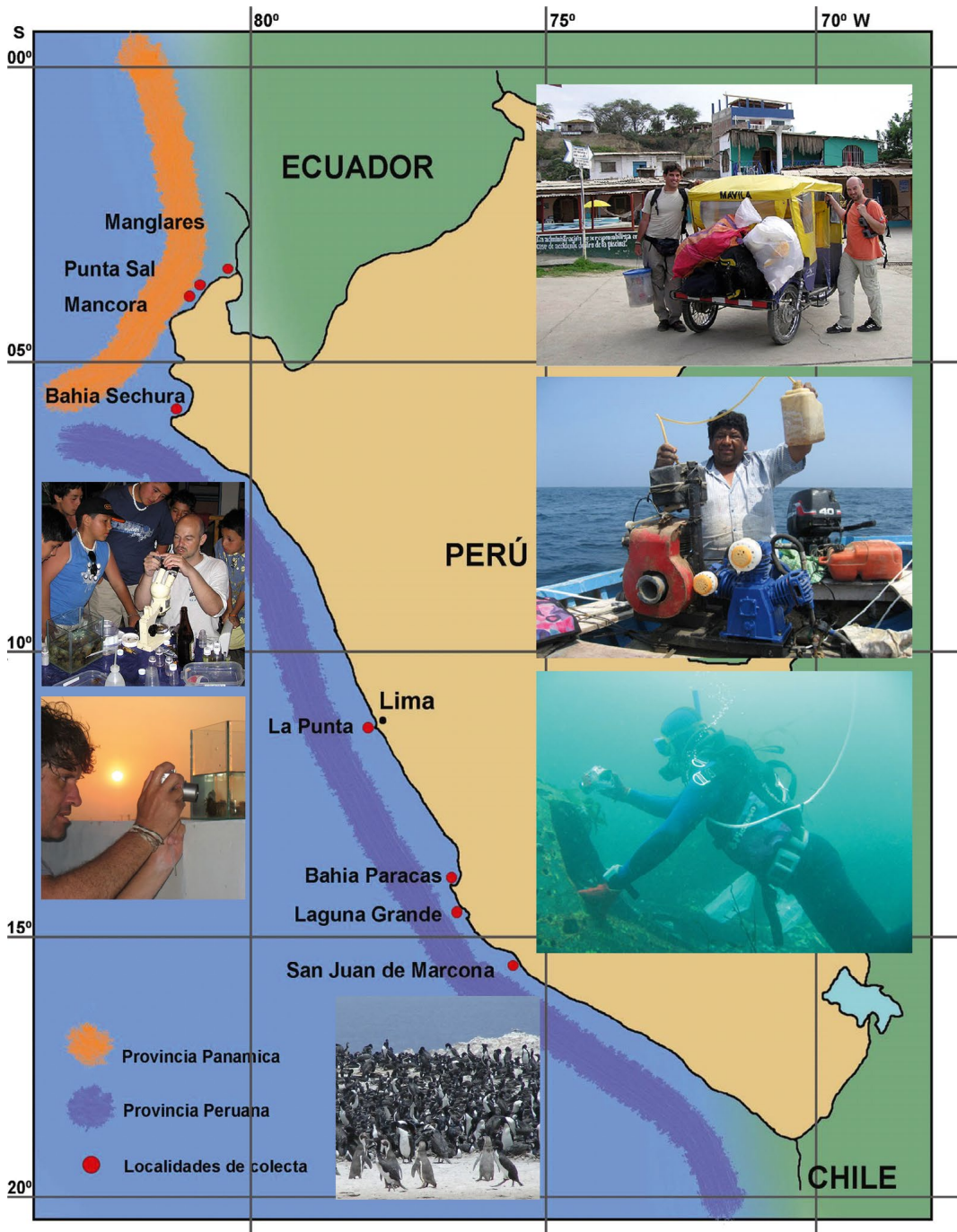
Fig. 1. Map of collecting areas. Large inserts show authors and equipment transported via mototaxi in Mancora, fisherman operating hookah diving compressor, and second author collecting in cold waters off San Juan de Marcona using compressor and garden hose. Small inserts show authors documenting live specimens after collecting, and Humboldt penguins resting at the Atacama desert coast, southern Peru.