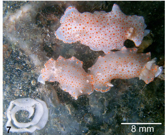
Figs. 2–7. Spongivory events by nudibranchs from Rio de Janeiro, southeastern Brazil. 2–3. Felimare lajensis preying on Dysidea etheria (2, adult; 3, juvenile). 4. Felimida binza preying on Chelonaplysilla erecta . 5. Felimida paulomarcioi preying on Darwinella sp. 6. Tyrinna evelinae preying on Dysidea etheria . 7. Tyrinna evelinae and its egg mass over another prey, an unidentified chalinid species (order Haplosclerida).