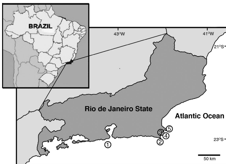
Fig. 1. Study area and collection sites on the coast of Rio de Janeiro State, southeastern Brazil. 1. Cagarras Archipelago, Rio de Janeiro; 2. Forno beach, Arraial do Cabo; 3. Tide pool near Canal do Itajuru, Cabo Frio; 4. Papagaio island, Cabo Frio; 5. Tartaruga beach, Armação dos Búzios.

In this study we provide new data on spongivory by dorid nudibranchs along the coast of Rio de Janeiro State, southeastern Brazil, including the identification of the species involved and comparing their diet patterns to those reported for species in other regions of the world.