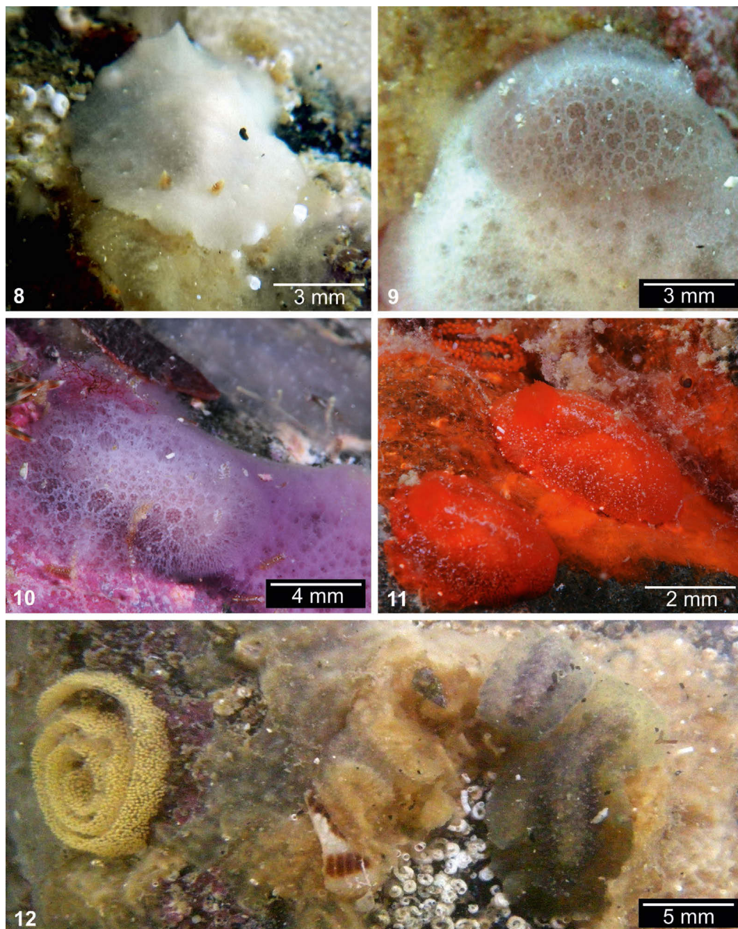
Figs. 8–12. Spongivory events by nudibranchs from Rio de Janeiro, southeastern Brazil. 8. Cadlina rumia preying on Haliclona sp. 9. Jorunna spongiosa preying on Callyspongia pallida. 10. Jorunna spazzola preying on Chalinula sp. 11. Ros-tanga byga preying on Mycale microsigmatosa. 12. Doris kyolis and its egg mass over Lissodendoryx isodictyalis.