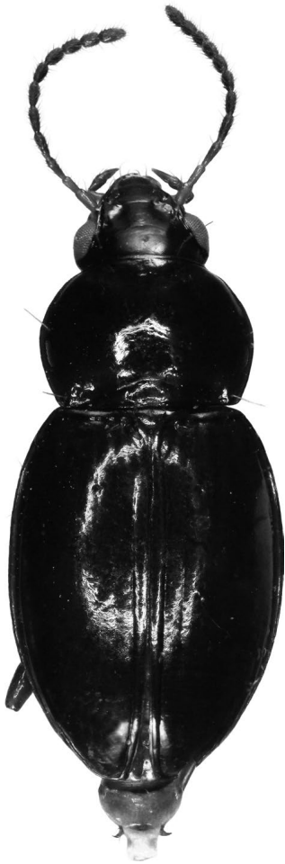
Fig. 1. Sloaneana curvicollis , spec. nov. Habitus. Body length: 3.9 mm.

Sloaneana Csiki, 1933: 1651 (nom. nov. for Sloanelia Csiki, 1928). – Moore et al. 1987: 123; Baehr 2002: 9; Lorenz 2005: 201; Eberhard & Giachino 2011: 3.