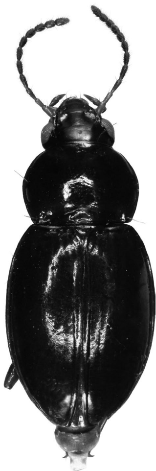
Fig. 1. Sloaneana curvicollis , spec. nov. Habitus. Body length: 3.9 mm.

Sloaneana Csiki, 1933: 1651 (nom. nov. for Sloanella Csiki, 1928). – Moore et al. 1987: 123; Baehr 2002: 9; Lorenz 2005: 201; Eberhard & Giachino 2011: 3.