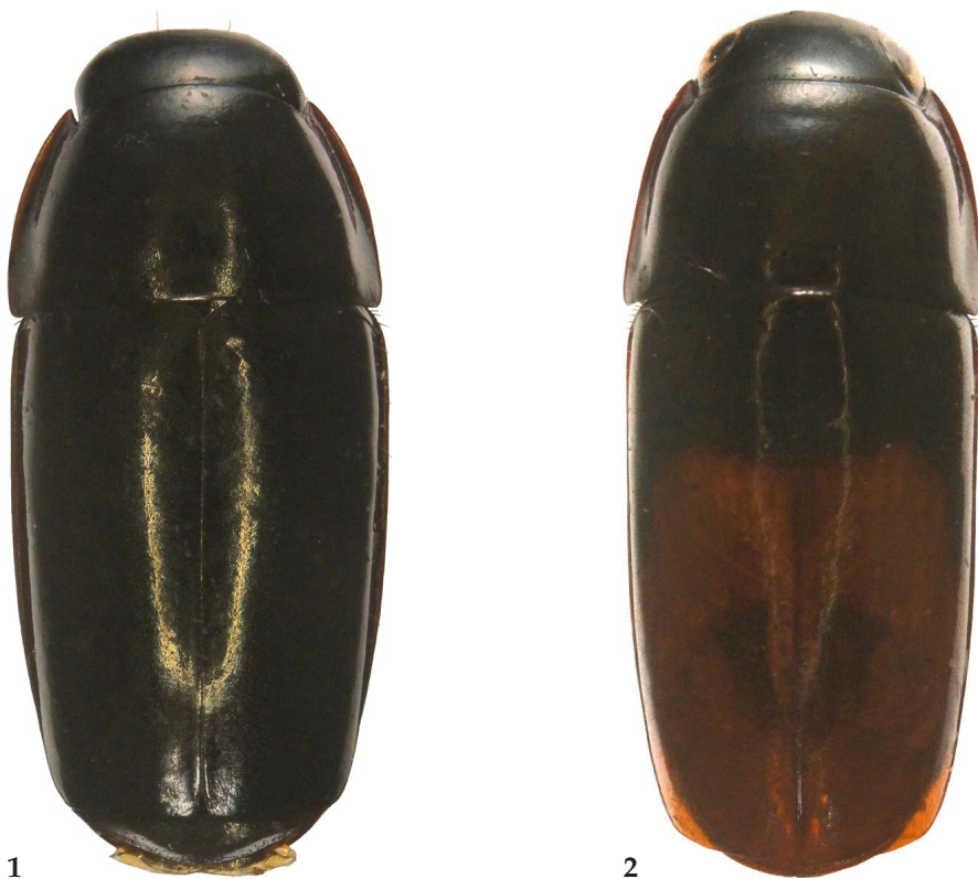
Figs 1-2. Habitus. Body lengths in brackets. 1. Adelotopus nigerrimus , spec. nov. (5.6 mm). 2. Adelotopus mutchillbae , spec. nov. (5.4 mm).