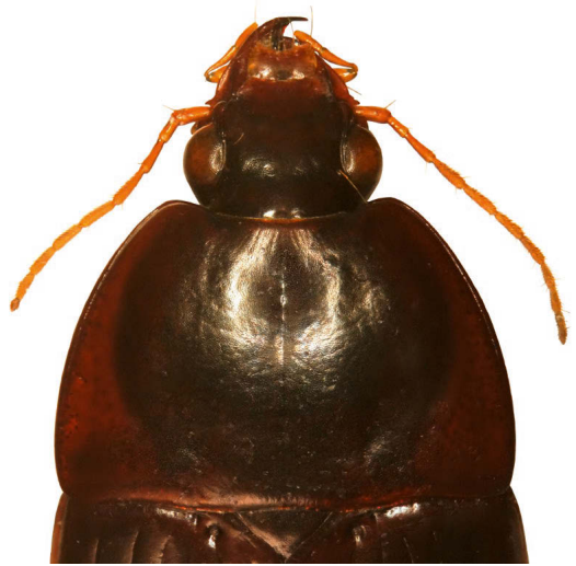
Fig. 2. Coptocarpus oberprielerae , spec. nov. Head and pronotum.

the left one very large, convexly triangular, the right smaller, in apical part triangular.