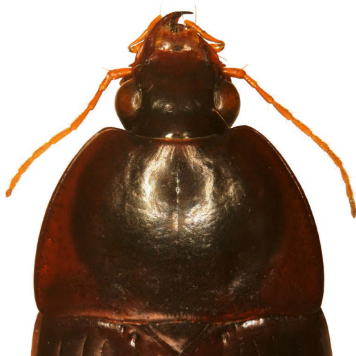
Fig. 2. Coptocarpus oberprielerae , spec. nov. Head and pronotum.

the left one very large, convexly triangular, the right smaller, in apical part triangular.