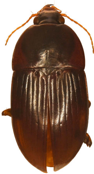
Fig. 1. Coptocarpus oberprielerae , spec. nov. Habitus. Length 9.5 mm.

long. Tarsomere 4 very asymmetrically inserted at the median part of the apex of tarsomere 3.