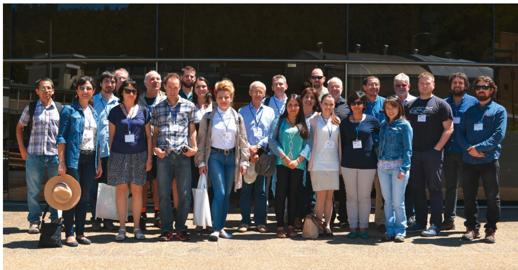
Fig. 1. Participants of FORUM HERBULOT 9 in Concepción, Chile.

tral zone of Chile and its fauna. During a two-days visit to the impressive Cordillera de Chillán (Las Trancas) collecting was possible in the mountainous temperate forests of southern Chilean Andes.