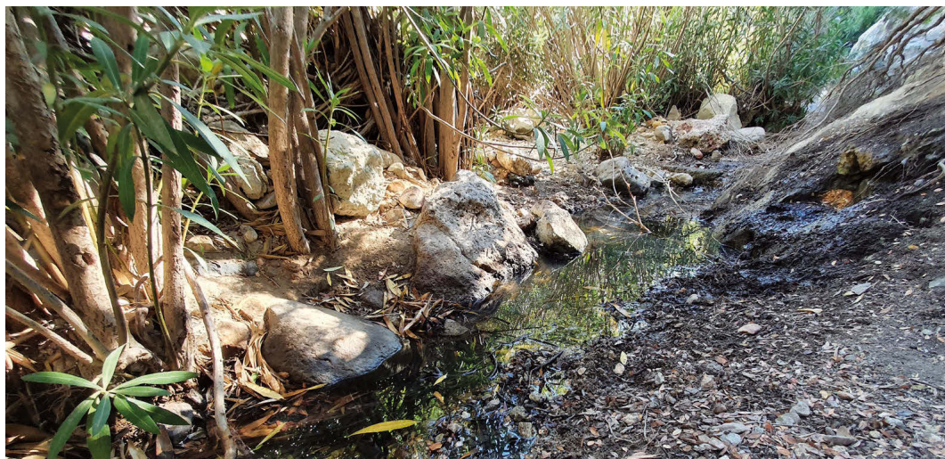
Fig. 3. Residual pool where 5 different Milos viper individuals were observed.

also on Sifnos (Cattano 2020). Intensive hunting represented the major cause of decline and extirpation for other venomous snakes, such as the timber rattlesnake Crotalus horridus in North America and Canada (Furman 2007). Following the acquisition of legal protection in 1981 (Nilson 2019), the number of M. schweizeri specimens directly killed by humans strongly declined. Specifically, Nilson et al. (1999) report that, over a time frame of four years, they found just less than five specimens intentionally killed by humans. Nevertheless, Nilson will later contradict himself stating that “specimens are still killed in significant numbers”, implicitly declaring that around 100 individuals may be killed by humans yearly on Milos (Nilson 2019). This latter data seems to be supported by the attitude of locals towards M. schweizeri and its conservation. In 2003, a written inquiry to the European parliament highlighted the opposition of Milos professionals and stakeholders to the development of a “viper reserve”, as Milos vipers were considered a serious threat for both public health and the island’s economic growth (Trakatellis 2003). Furthermore, the same negative attitude emerged from a study conducted on a demographic and social heterogeneous sample of over one thousand Greek people, where the conservation of the Milos viper, perceived as “ugly” and dangerous, was largely not supported (Liordos et al. 2017).