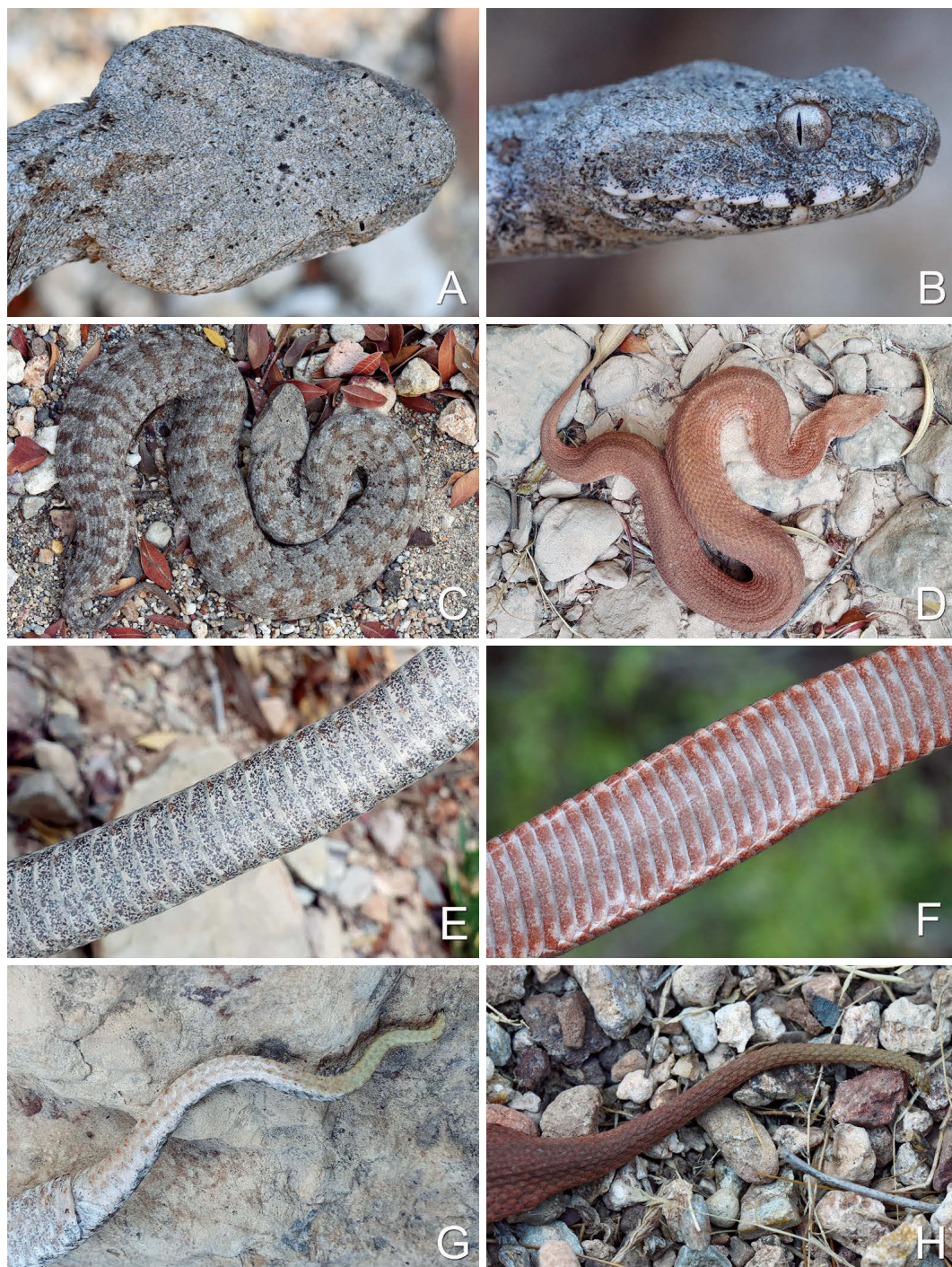
Fig. 2. Macrovipera schweizeri details: A. Head in dorsal view; B. head profile; C. dorsal colouration in a standard individual; D. dorsal colouration in a reddish individual; E. ventral colouration in a standard individual; F. ventral colouration in a reddish individual; G. tail colouration (ventral) in a standard individual; H. tail colouration (dorsal) in a reddish individual. Photo credits: Matteo R. Di Nicola.