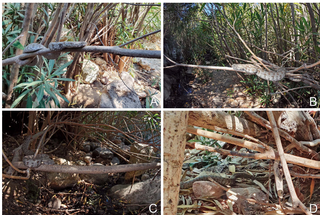
Fig. 4. Macrovipera schweizeri individuals observed “in situ” near the residual pool during the day.

The first record is from the 24 th of September, at 8:58 h (sunny weather, T = 19^{\circ}\text{C} , wind = 17 km/h). An individual with uniform, reddish colouration, likely a female (TL = ~50 cm), was observed moving among the stones of a completely dry seasonal stream bed (approx. coordinates: 36.66, 24.40; elev. 67 m a.s.l.) (Fig. 2D). In the stretch of stream visited there was no residual water, and the only other vertebrates encountered in activity were Kotschy’s geckos ( Mediodactylus kotschyi , n = 2 ) and Milos wall lizards ( Podarcis milensis , n = 5 ).