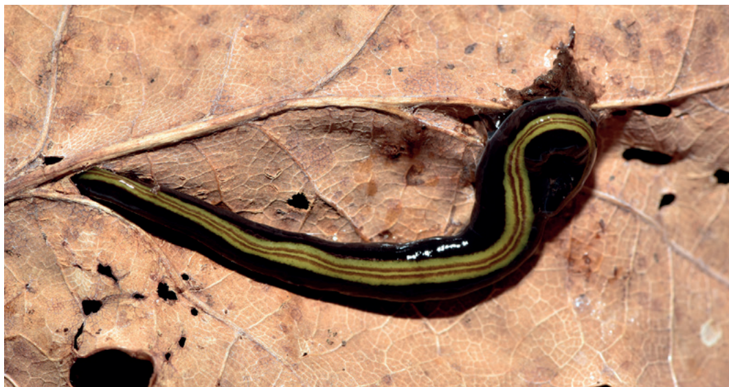
Fig. 1. Caenoplana variegata from a garden in Korschenbroich-Kleinenbroich, Germany, collected in March 2024.