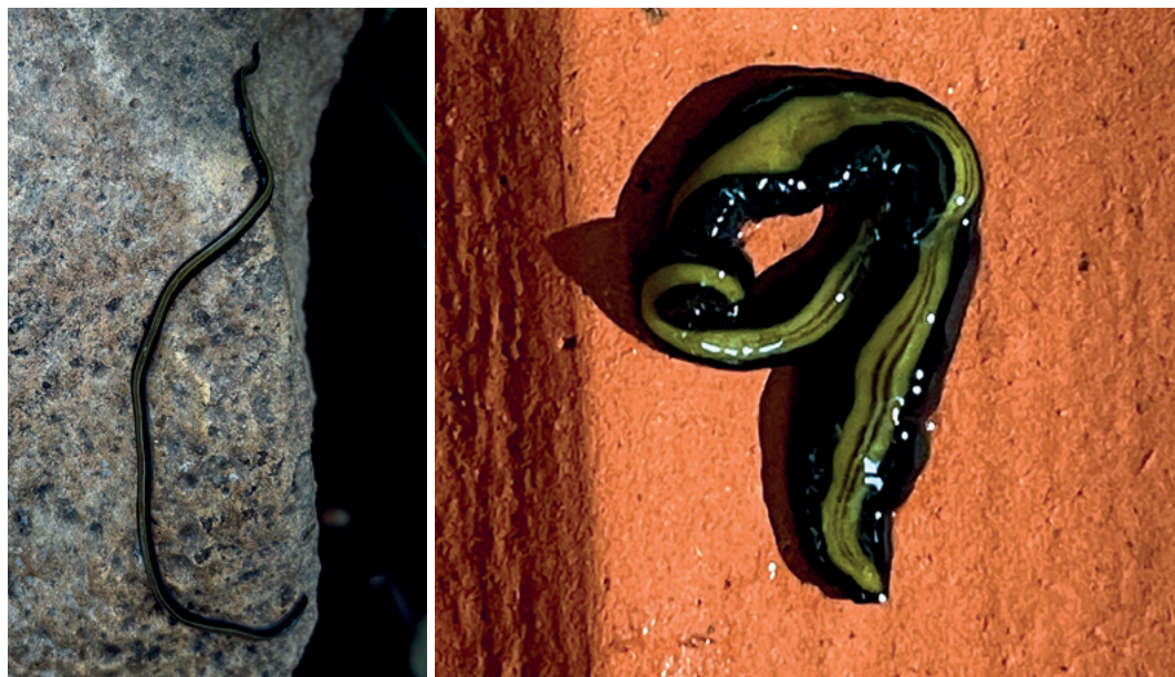
Fig. 3. Caenoplana variegata on a rock in the Australia enclosure at Haus des Meeres Aqua Terra Zoo, Vienna, Austria, in February 2024.