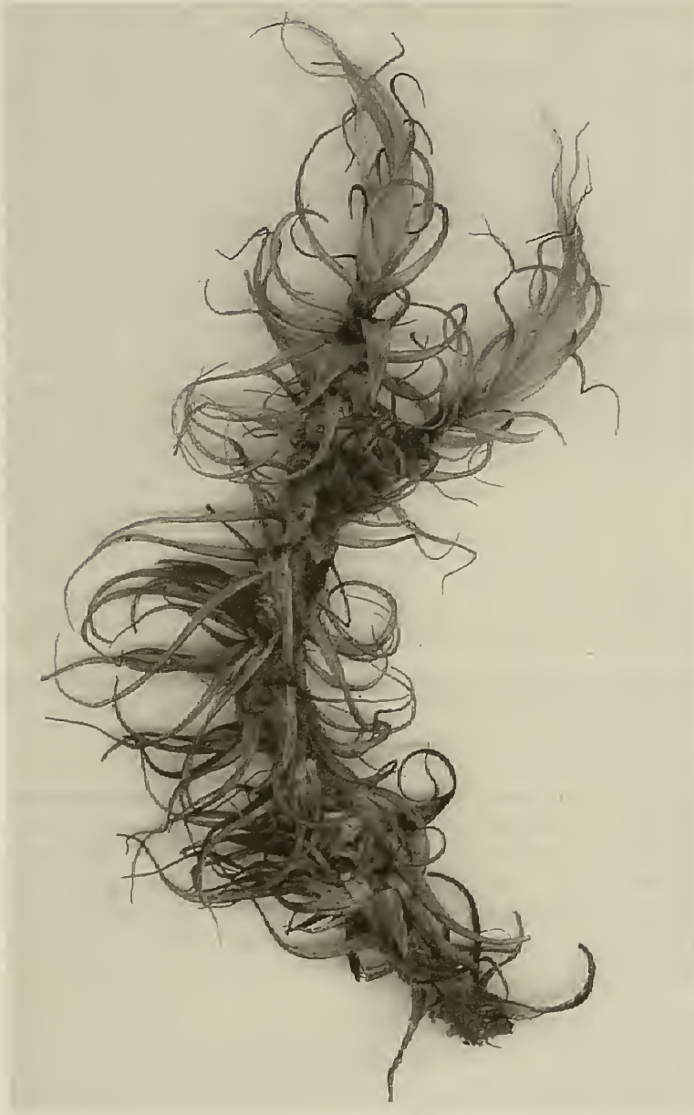
Fig. 3. Female plant of Dicranum dispersum spec. nov. – Actual size: 3 cm.

Eurasian distribution (fig. 2), and a restriction to calcareous areas. Samples from Mongolia and the Alatau have been mixed with Rhytidium rugosum and Abietinella abietina which suggests the ecology in these areas to be close to that in Europe.