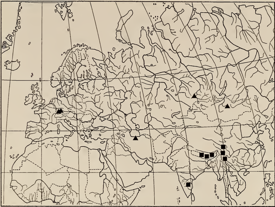
Fig. 2. Approximate distributions of Dicranum dispersum spec. nov. (triangles) and D. crispifolium Müll. Hal. (quadrats).

walled, in a broad band from the margin towards the nerve. Pseudomonoicous; male plants (fig. 1g) dwarfed, attached to the rhizoids of female plants; perichaetial leaves (fig. 1e) convolute, sheathing, abruptly acuminate. Seta single in each perichaetium, 1.5–2.5 cm long, yellow or pale reddish yellow; capsule (fig. 1f) 2.5–3.5 mm long, curved, suberect to horizontal, furrowed when dry; peristome teeth normal dicranoid ca 550 \mu m; spores globose to ovoid, brownish yellow, minutely papillose, 16–21 \mu m.