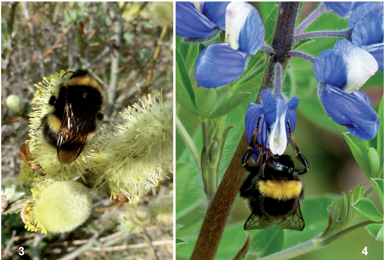
Figs. 3–4. Bombus lucorum queens visiting flowers in Iceland. – 3. Salix lanata (Bakkagerði, Höfn, 4.VI.2014). 4. Lupinus nootkatensis (Húsavík, Laxá, 8.VI.2014).

and snow. If we suppose that 177 grids are not ice- or permanently snow-covered, until today B. jonellus has been observed in 58 grids (33 %).