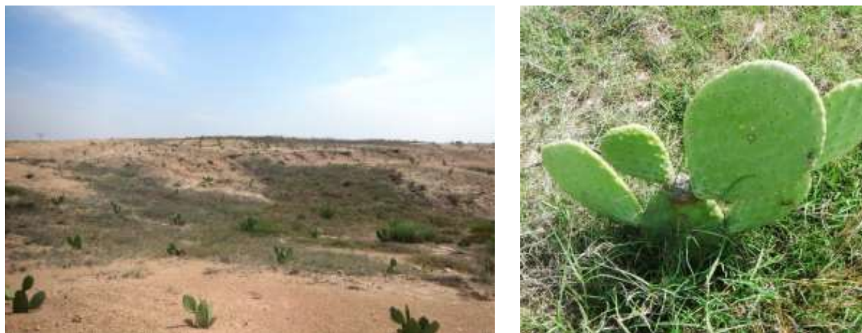
Fig. 4. Cultivation of spineless cactus O. ficus-indica under AIP in Chakwal for fodder purposes.

After the 2014 monsoon, Rangeland Research Institute, NARC under Agriculture Innovation Program (AIP) introduced spineless prickly pear species, i.e. Opuntia ficus-indica to cultivate in the fields of the targeted villages on approximately 30 ha ( Fig. 4 ).