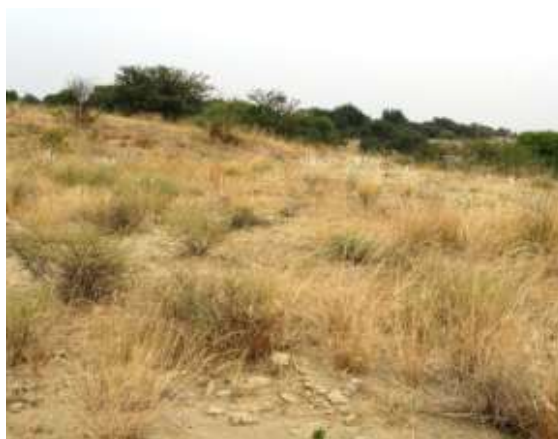
Fig. 8. Completely vanished field of O. ficus-indica in District Chakwal.