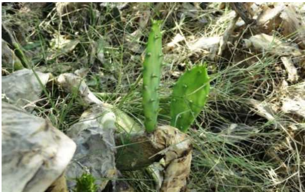
Fig. 11. Regrowth of cladode from debris/damaged cactus in District Chakwal.