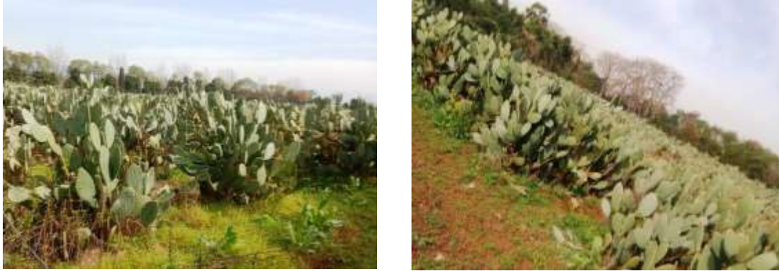
Fig. 2. Imported Cacti germplasm at National Agricultural Research Centre (NARC), Pakistan.

The district Chakwal is located at 32°56'17"N, 72°51'30.71"E., on the Pothohar Plateau, Punjab, Pakistan ( Fig. 3 ). It is situated in the north of the Punjab province, bounded by district Khushab to its South, district Rawalpindi to its northeast, district Attock to its northwest, district Jhelum to its East and district Mianwali to its West. District Chakwal is comprised of four tehsils namely Kallar Kahar, Chakwal, Choa Saidan Shah and Talagang. Dominant flora of the Chakwal districts consists of Acacia modesta , Acacia nilotica and Dalbergia sissoo . Approximately 50% of the area is uncultivated and primarily used for grazing animals, and about 11% is natural grasses and shrubs. District Chakwal is the largest peanut producer in Pothohar region, where the peanut is largely grown in the tehsil of Chakwal and Talagang, and peanut stubble is the main stock to the small ruminants in the area. Due to high demand of peanut straw in large cities, the shrubby vegetation mainly supports the grazing of goats and sheep.