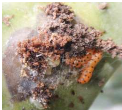
Fig. 6. Larvae inside the cladode of O. ficus-indica in District Chakwal.