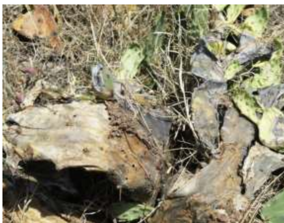
Fig. 10. Damaged wild cactus in District Chakwal.