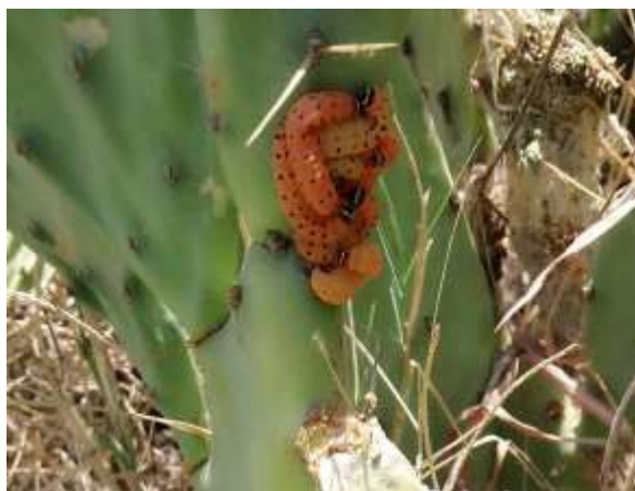
Fig. 9. C. cactorum infested cladode of wild cactus in District Chakwal.

After confirmation that the cladodes of cultivated O. ficus-indica were infested by the invasive moth, C. cactorum , plans were made to conduct detailed surveys for the whole district of Chakwal. Surveys were conducted for all tehsils of district Chakwal to discover the level of infestation of C. cactorum on wild Opuntia species which was introduced naturally/deliberated ( Figs. 8 & 9 ). Surveys were consecutively conducted from July 2019 to July 2021. During consecutive surveys over two years, it was found that sporadic plantation of wild cactus throughout the district Chakwal was in the stage of re-growing ( Fig. 11 ) from the debris of the cactus, which were damaged through the heavy attack of the larvae. However, larvae were found at various localities in tehsil Talagang of district Chakwal on wild cactus. In all surveyed localities wild cactus was severely infested by the cactus moth and threatened ( Figs 7 & 10 ). During this study establishment of C. cactorum has been confirmed after the introduction of the cactus moth larvae in the district Chakwal, Pakistan during 1994.