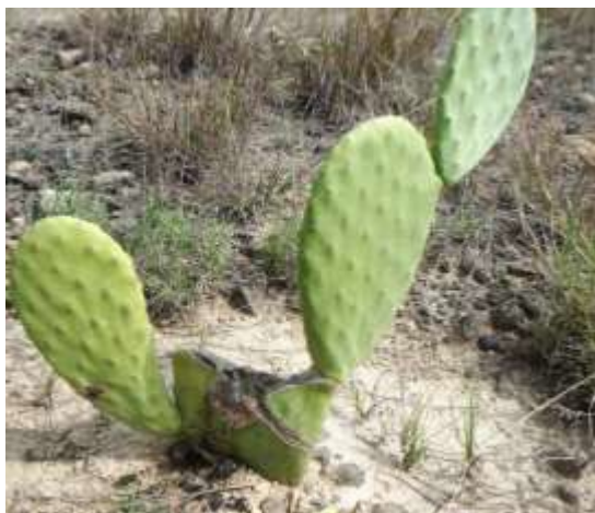
Fig. 5. Infested cladode of spineless O. ficus-indica in cultivated field in District Chakwal.

After planting, all fields were visited once a month. The growth of O. ficus-indica was found to be excellent in all the targeted fields until November 2016. However, during the December 2016 survey it was observed that a few cladodes of O. ficus-indica were found dead with infestation of an unknown pest ( Fig. 5 ). All infested pads were removed and burned. In December 2017, the same infestation was again reported and the majority of the cladodes were found to be infested. Infested cladodes were examined in the field and some lepidopterous larvae were found inside the cladodes ( Fig. 6 ). Larvae were brought to the laboratory of the National Insect Museum for identification. However, in July 2019 it was found that cultivated O. ficus-indica at all the three localities had completely vanished due to the heavy attack by cactus moth larvae (Figs. 7 & 8).