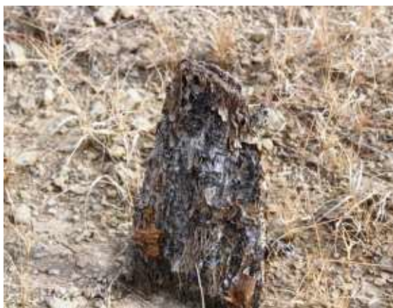
Fig. 7. Dead cladode of O. ficus-indica in vanished field in District Chakwal.