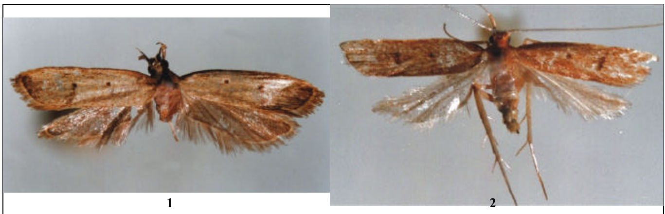
Figures 1-2 Adults. Fig. 1. ♂ Quassitagma glabrata Wu and Liu, 1992: Guizhou Province, China. Fig. 2. ♂ Lecitholaxa thiodora (Meyrick): Guizhou Province, China.