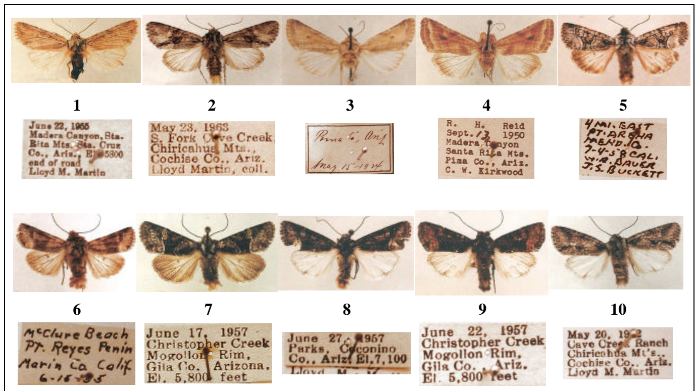
Figures 1–10. New Lacinipolia species. Fig. 1. Paratype ♂: L. delongi . Fig. 2. Paratype ♂: L. aileenae . Fig. 3. Holotype ♂: L. triplehorni . Fig. 4. Allotype ♀: L. triplehorni . Fig. 5. Paratype ♂: L. bucketti . Fig. 6. Paratype ♂: L. baueri . Fig. 7. Paratype ♂: L. sharonae . Fig. 8. Paratype ♂: L. fordii . Fig. 9. Paratype ♂: L. franclemonti . Fig. 10. Paratype ♂: L. martini .

The genotype of Lacinipolia is Mamestra illaudabilis Grote, 1875. In Poole's 1989 Noctuid catalog, 76 species are listed, confined to North, Central and South America. Of these, 58 are found in North America (MONA, 1983 plus Leuschner, 1992). One additional species was described by Mustelin in 2000; this paper adds nine more, so the above totals are increased by ten to 86 and 68 respectively.