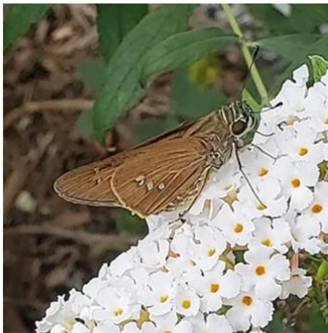
Fig. 6. Calpodus ethlius , 9/6/2018, Leesburg, VA on Buddleia .

Eurytides marcellus – Common in woodlands, but mostly in spring. Three broods: MAR to mid-MAY, JUN through JUL, mid-AUG to early-SEP. Emerging as early as 3/11 (in 2016). An irruption beginning 4/13/2016 brought hundreds out of the forest into the adjacent residential neighborhood with adults frequently observed flying over streets and lawns. Larvae were found on the host Asimina triloba ( Fig. 2 ). An egg was found on 10/12/2020, as some host trees were starting to turn yellow and dropping leaves shortly thereafter. The resultant larva was raised on a supply of refrigerated leaves until pupation in early DEC. While rearing larvae of marcellus in May of 2015, I was astounded to observe several caged larvae tie a folded leaf or two together, forming a loose shelter in which they pipated. The edges of the folded leaves were held together in several places with a silk button. Insect predators would likely not be deterred from entering the shelters, however this structure might shield them from birds.