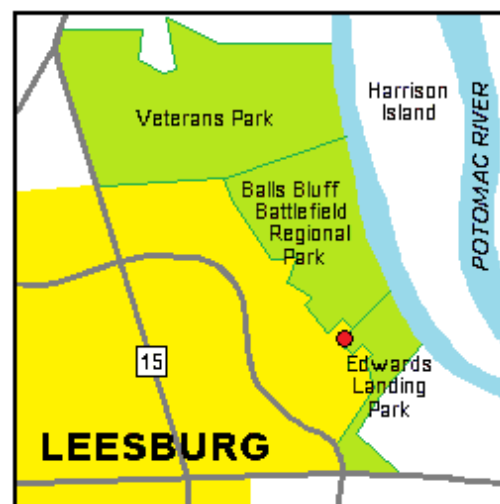
Fig. 1. Map study area. Red = Author's residence. Yellow = Residential and commercial development.

In the forest understory, young Fagus grandifolia (American Beech) trees are very common. In upland locations, there are scattered Celtis occidentalis (Hackberry), Lindera benzoin (Spicebush), Hamamelis virginiana (Witch Hazel), Prunus serotina (Black Cherry), Cornus florida (Flowering Dogwood) ( Fig. 4 ) which is resistant to the Dogwood Anthracnose fungal blight, and Viburnum prunifolium (Blackhaw) which has noticeably increased its presence over the study period ( Fig. 4 ). One small area of understory contains a large stand Cercis canadensis (Redbud). Asimina triloba (Paw Paw) is abundant in groves in both upland and lowland situations, and grows in thickets of great height along the Potomac River ( Fig. 5 ). Robinia pseudoacacia (Black Locust) occurs in more recently forested second growth stands and Elaeagnus angustifolia (Russian Olive) manages a foothold along forest edge habitats and in sunny open places in the forest. Low-growing species of Gaylussacia (Huckleberries) and Vaccinium (Blueberries) are frequent atop the cliffs above the Potomac River. Within the forest are large growths of Symphoricarpos orbiculatus (Coralberry) and invasive Rubus phoenicolasius (Wineberry). In sunny places near the forest edge and along wide pathways, thickets of invasive Rosa multiflora (Multiflora Rose) ( Fig. 3 ), Rubus