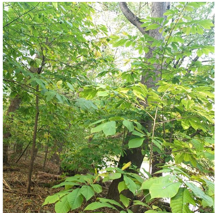
Fig. 5. Asimina triloba along the Potomac River. (Host of Eurytides marcellus .)