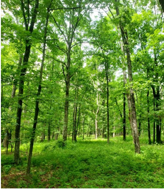
Fig. 2. Deciduous forest.

fruticosus (Blackberry), and Lonicera japonica (Japanese Honeysuckle) climb over everything. A naturalized stand of native Ptelea trifoliata (Wafer Ash or Hop Tree) occurs in one small area; saplings have been identified in other parts of the forest especially atop the river cliffs. Similarly, Juniperus virginiana (Eastern Red Cedar) occurs as scattered trees throughout the area, but mainly along forest edge habitats. In some places they form small thickets of young shrubs.