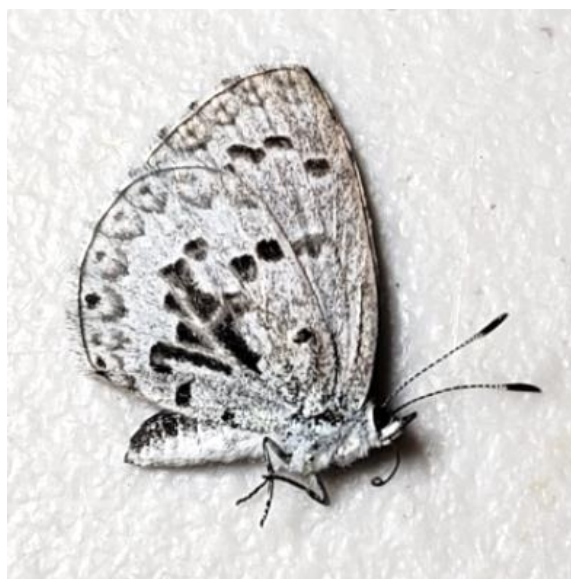
Fig. 7. Rare patched aberrant of Celastrina neglecta spring form, 4/5/2013, Leesburg, VA.