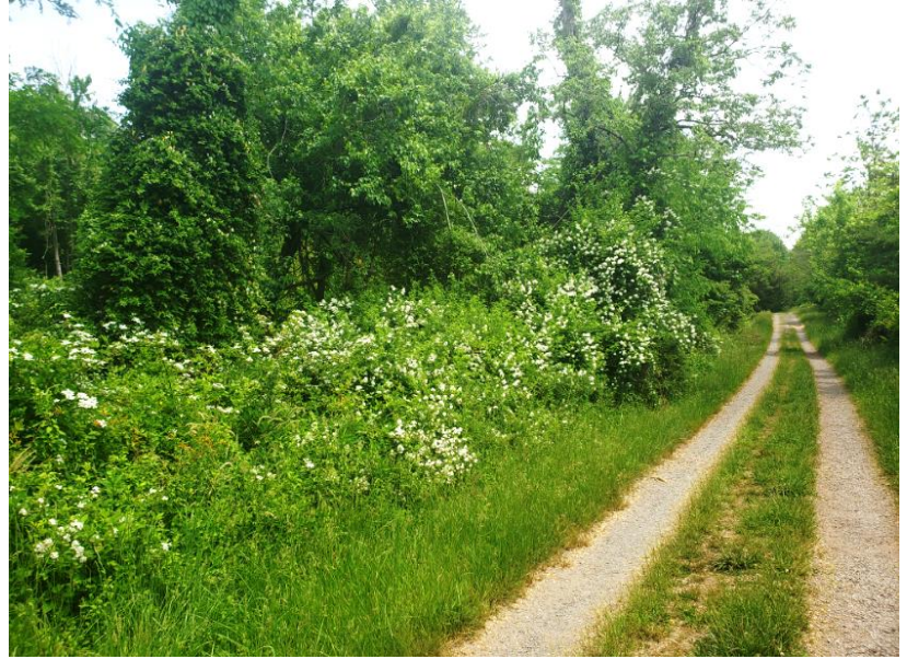
Fig. 3. Rosa multiflora thickets dominate forest edges.