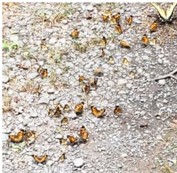
Fig. 8. Chlosyne nycteis eruption, 7/19/2019.

Chlosyne nycteis nycteis – During most years there are two broods, MAY and JUL, some years erupting in huge numbers (thousands observed in all habitat types and in adjacent neighborhood in mid-JUL 2018 and 2019) (Fig. 8). 1 st instar larvae of the second brood have been observed to abandon their communal webs and drop into the forest litter and go into diapause for the winter, but during some seasons a portion of the larvae develop to produce a partial third brood in late-AUG to SEP. Many third brood adults recorded over several years (2010-2019) between 8/20 (in 2019) and last seen 9/15 (in 2012), but exceptionally common on 9/5/2018 and 8/30/2019. Adults preferred nectaring on orange Zinnia flowers and Foeniculum vulgare in my garden. Hostplants include Verbesina alternifolia (which were mass-defoliated in 2019) along forest paths and clearings, and Helianthus annuus in my garden.