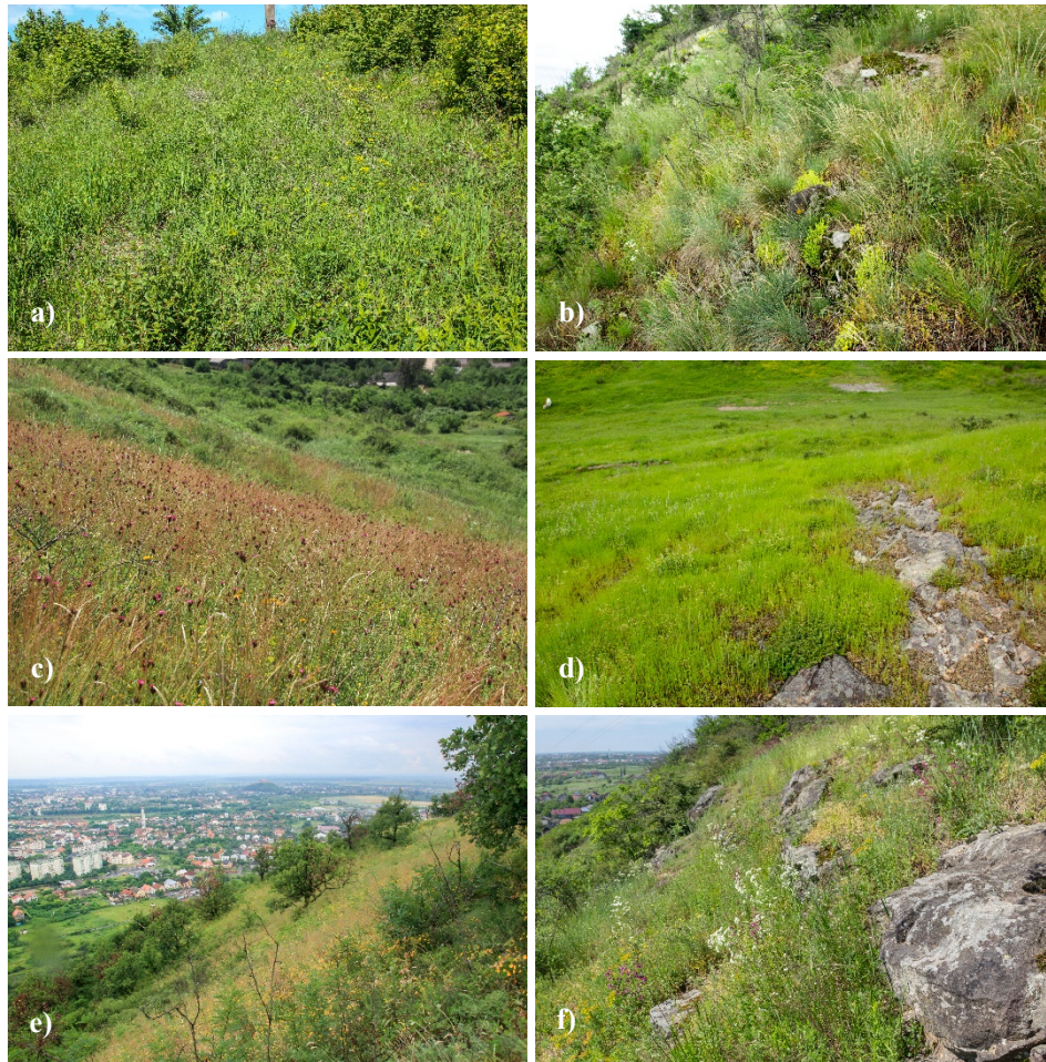
Fig. 3. a) Scabioso ochroleucae-Brachypodietum pinnati near the village of Perechyn in the Upper Uzh River valley; b) Festucetum pseudodalmaticae with tussocks of Festuca pseudodalmatica on Chornahora Hill near Vynohradiv; c) Astero linosyris-Festucetum rupicolae dominated by Dianthus carthusianorum , Festuca stricta subsp. sulcata and Inula ensifolia near the village of Muzhievo in the Berehove area; d) Airo-Vulpietum dominated by Potentilla argentea , Scleranthus annuus and Vulpia myuros with patches of Thymus pannonicus agg. near the village of Veryatsya in the Vynohradiv area; e) Exposure-related forest-steppe on Lovachka Hill above the town of Mukacheve with Festucetum pseudodalmaticae and Airo-Vulpietum ; f) A mosaic of Festucetum pseudodalmaticae grassland and thermophilous scrub near Onokivtsi (Photos: a) M. Chytrý, May 2017; b), d), f) K. Chytrý, May 2017; c), e) K. Chytrý, June 2016).

Abb. 3. a) Scabioso ochroleucae-Brachypodietum pinnati nahe Perechyn im oberen Uzh-Tal); b) Festucetum pseudodalmaticae mit Horsten von Festuca pseudodalmatica auf dem Chornahora-Hügel nahe Vynohradiv; c) Astero linosyris-Festucetum rupicolae mit Dominanz von Dianthus carthusianorum , Festuca stricta subsp. sulcata und Inula ensifolia nahe Muzhievo in der Region Berehove; d) Airo-Vulpietum mit Dominanz von Potentilla argentea , Scleranthus annuus und Vulpia myuros sowie Gruppen von Thymus pannonicus agg. nahe Veryatsya in der Region Vynohradiv; e) Expositionsbedingte Waldsteppe auf dem Lovachka-Hügel oberhalb von Mukacheve mit dem Festucetum pseudodalmaticae und dem Airo-Vulpietum ; f) Mosaik aus dem Festucetum pseudodalmaticae grassland und thermophilen Gebüschern nahe Onokivtsi (Autoren der Fotos s. o.).