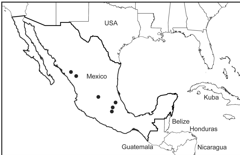
Fig. 4: Distribution of C. melleum in Mexico.