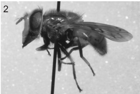
Fig. 2: Copestylum melleum (Jaenicke), male from the Canary Islands.