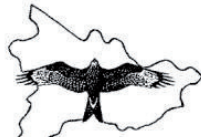
Avifaunistische Arbeitsgemeinschaft Lüchow-Dannenberg