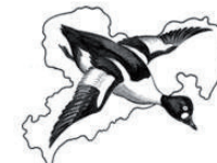
Förderverein Vogelschutzwarte Neschwitz