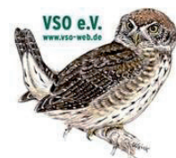
Verein Sächsischer Ornithologen