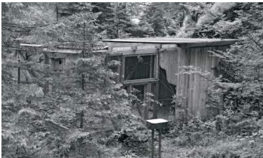
Figura 3 - Um dos dois aviários para libertação na Área Silvestre de Dürrenstein.