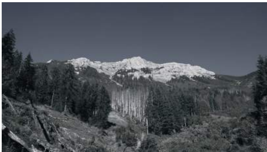
Figura 1 - Área Silvestre de Dürrenstein – categoria Ia (Reserva Natural Estrita) e Ib (Área Silvestre) da IUCN e Sítio Património Mundial da UNESCO, vista para a montanha de Dürrenstein, 1.893 m.

ing that a well-functioning tracking system was required. Telemetry enabled the determination of survival rates, dispersal timing and distances, habitat analyses, territory analyses, enabled the finding of nests in natural tree holes, and confirmed that owls were traveling between the two release areas and the broader regional populations. Based on the locations/territories of the owls, a network of nest boxes was established. The use of nest boxes pursued two main goals: a) compensate for the lack of natural breeding cavities, and b) provided a means of more readily monitoring the nesting success of the owls.