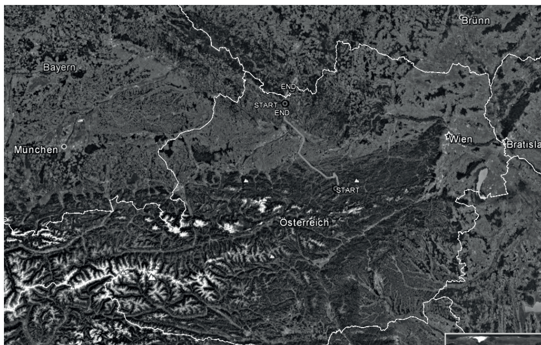
Figura 10 - Rota de dispersão de 150 km de um juvenil de coruja dos Urales libertado em julho de 2017 na Área Silvestre de Dürrenstein (Áustria), migrando em agosto de 2017 e atingindo a Floresta da Boémia (República Checa) no início de setembro de 2017.