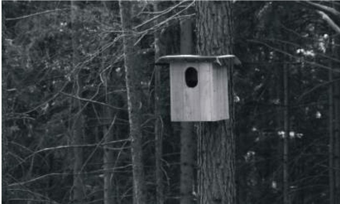
Figura 5 - Caixa-ninho em madeira de pinheiro-negro, com 40 x 40 x 60 cm e 25 kg, a uma altura de cerca de 5 m.

Different monitoring tools were implemented to survey the success of the project: telemetry, camera traps, light barriers in combination with cameras, monitoring of nest boxes, ringing, genetics, call surveys and direct sightings. During the breeding season all nest boxes, often in steep terrain with snow cover, are visited with a telescope stick and a camera (photo camera or video camera) for monitoring the breeding status of the Ural Owls. The genetic analyses was carried out by the Research Institute of Wildlife Ecology (FIWI).